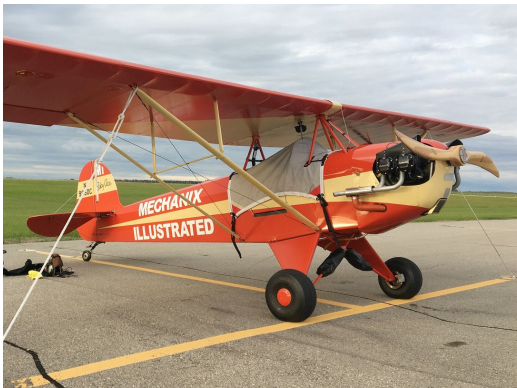
Corben Baby Ace Cockpit Cover

This cover type is made from Silver Acrylic Sunbrella canvas and is 100% lined with a soft and smooth microfiber. Bruce's Custom Covers developed this material combination especially for aircraft protection. The outer material is medium weight and treated for water resistance, UV resistance and anti-static buildup. The inner lining is a very soft and smooth microfiber to prevent scratching. The material is very reflective, and tests show that the cabin interior temperature can be reduced to near-ambient temperature on the hottest of days. It is water, ice and snow repellent, yet breathable to allow moisture to escape from between the cover and the aircraft surface.