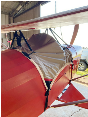
Corben Junior Ace Travel Weight Canopy Cover