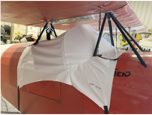
Corben Junior Ace Cockpit Cover, test fit cover