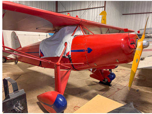
Corben Baby Ace, Junior Ace, and similar models Cockpit Cover