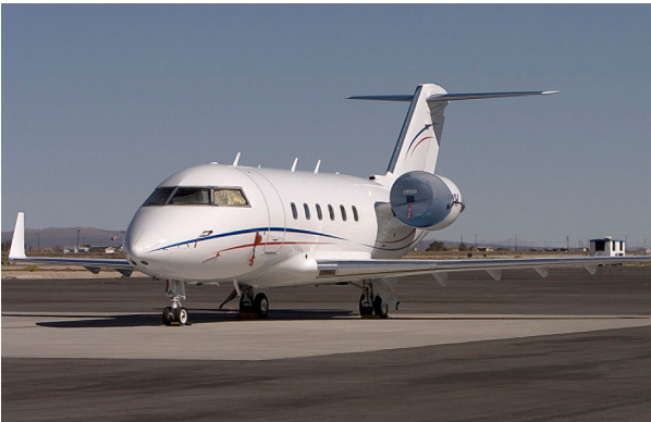
Challenger 604 Intake Covers, standard design