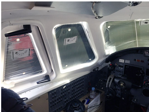
Cessna Citation XL, XLS (560XL) Cockpit Heatshields

Cockpit Heatshields are interior sunshades for the aircraft's cockpit. The product is a unique composite of closed-cell foam with a silver mylar finish. The semi-rigid design is stiff enough to stand inside the window framing. The set folds up flat and is easily stored in the included storage sleeve. Some designs may require velcro and suction cups. Our Heatshields for jets are offered white side out because some aircraft manufacturers have issued advisories against reflective window inserts due to potential heat damage. A Heatshield is an excellent short-term remedy for cockpit overheating, but an external fabric cover is more effective for long-term protection.