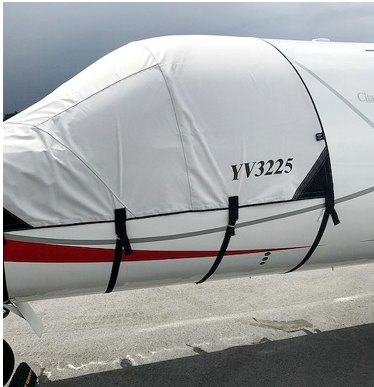
Cessna Citationjet V Ultra (560) Cockpit Cover

This cover type is made from Silver Acrylic Sunbrella canvas and is 100% lined with a soft and smooth microfiber. Bruce's Custom Covers developed this material combination especially for aircraft protection. The outer material is medium weight and treated for water resistance, UV resistance and anti-static buildup. The inner lining is a very soft and smooth microfiber to prevent scratching. The material is very reflective, and tests show that the cabin interior temperature can be reduced to near-ambient temperature on the hottest of days. It is water, ice and snow repellent, yet breathable to allow moisture to escape from between the cover and the aircraft surface.