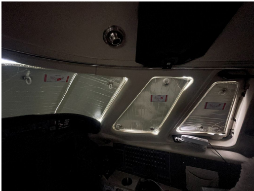
Cessna Citation 560XL Cockpit Heatshields