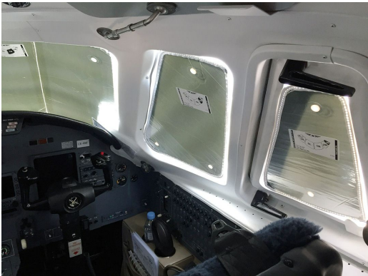
Cessna Citation XL, XLS (560XL) Cockpit Heatshields

Cockpit Heatshields are interior sunshades for the aircraft's cockpit. The product is a unique composite of closed-cell foam with a silver mylar finish. The semi-rigid design is stiff enough to stand inside the window framing. The set folds up flat and is easily stored in the included storage sleeve. Some designs may require velcro and suction cups. Our Heatshields for jets are offered white side out because some aircraft manufacturers have issued advisories against reflective window inserts due to potential heat damage. A Heatshield is an excellent short-term remedy for cockpit overheating, but an external fabric cover is more effective for long-term protection.