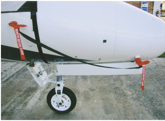
Citation XL Pitot Covers