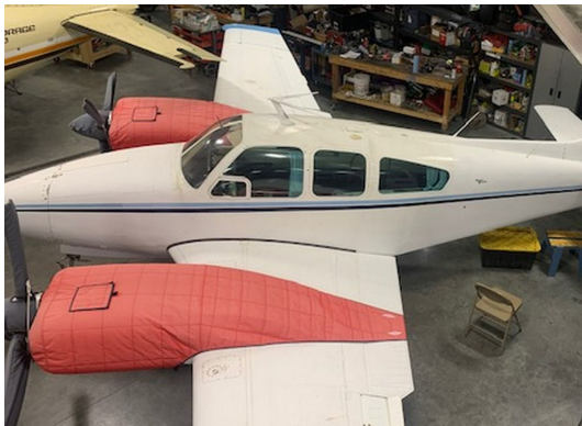
Beech Baron B55 Insulated Engine Covers

The material is very reflective, and tests show that the cabin interior temperature can be reduced to near-ambient temperature on the hottest of days. It is water, ice and snow repellent, yet breathable to allow moisture to escape from between the cover and the aircraft surface.