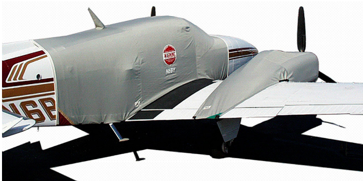
Baron Extended Canopy Cover & Engine Covers