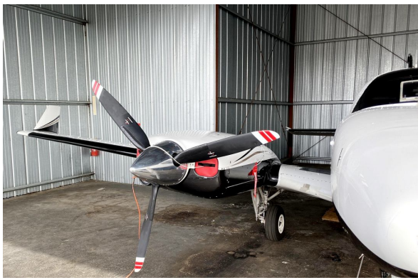
Baron 58 Engine Plugs