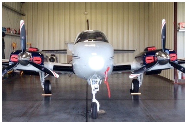
Beech Baron 58 Engine Inlet Plugs, Cowl Top Plugs, Heater Inlet, Pitot Cover