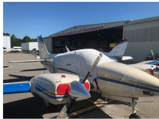
Beech Baron 95-B55 Canopy cover