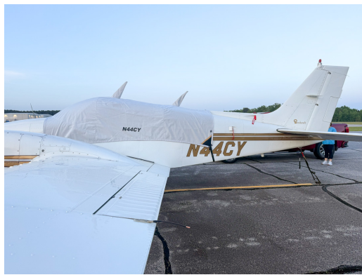
Beech Baron B55 Canopy Cover