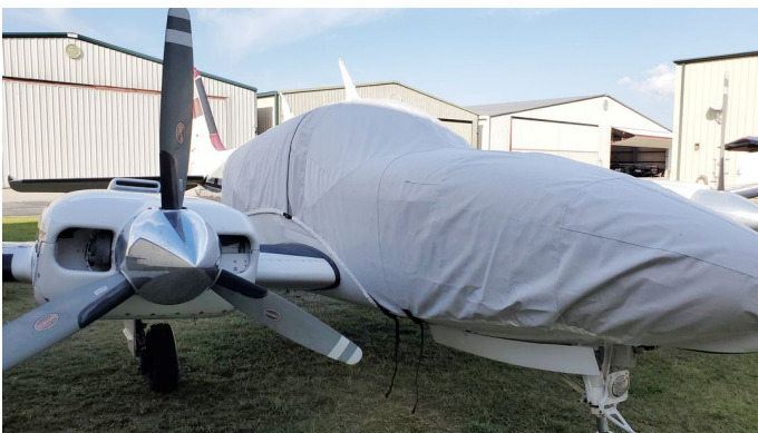
Beech Baron 58 Canopy/Nose Cover

This cover type is made from Silver Acrylic Sunbrella canvas and is 100% lined with a soft and smooth microfiber. Bruce's Custom Covers developed this material combination especially for aircraft protection. The outer material is medium weight and treated for water resistance, UV resistance and anti-static buildup. The inner lining is a very soft and smooth microfiber to prevent scratching. The material is very reflective, and tests show that the cabin interior temperature can be reduced to near-ambient temperature on the hottest of days. It is water, ice and snow repellent, yet breathable to allow moisture to escape from between the cover and the aircraft surface.