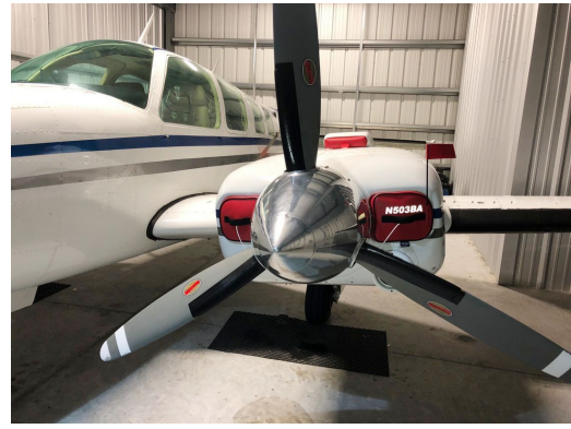
Beech Baron Engine Plugs