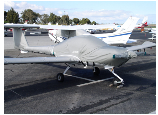
DA-20 Full Cover Set