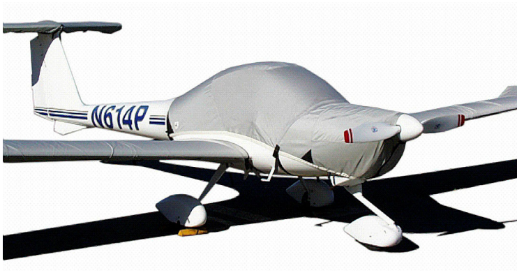
Diamond DA-20 Canopy/Engine, Wing & Horiz. Stab. Covers