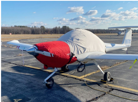
Diamond DA20-C1 Insulated Engine Cover, C1 models