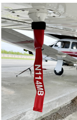
Blade-type Pitot Cover

Engine Inlet Plugs are custom fit for your Diamond DA-20, Katana, Eclipse intakes, made with heavy-duty vinyl material, and stuffed with a single block of sculpted urethane foam. Each plug has a zipper that allows the foam to be removed and dried if necessary. Engine plugs have warning flags that are visible from the cockpit or 'remove before flight' streamers sewn onto the face of the plugs. Most plugs are imprinted with the aircraft registration number in black for an extra charge. Storage bag NOT included. Engine plugs may be inserted after flight when the engine is still warm. Engine Inlet Plugs are commonly referred to as Cowl Plugs, Intake Plugs, Cowl Blocks, Engine Blocks, and Engine Bungs.