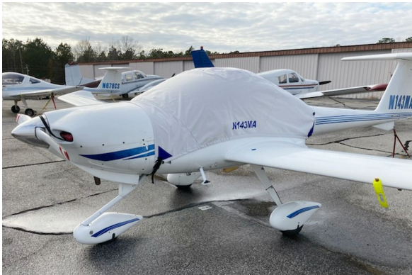
Diamond DA20-C1 Canopy Cover

This cover type is made from Silver Acrylic Sunbrella canvas and is 100% lined with a soft and smooth microfiber. Bruce's Custom Covers developed this material combination especially for aircraft protection. The outer material is medium weight and treated for water resistance, UV resistance and anti-static buildup. The inner lining is a very soft and smooth microfiber to prevent scratching. The material is very reflective, and tests show that the cabin interior temperature can be reduced to near-ambient temperature on the hottest of days. It is water, ice and snow repellent, yet breathable to allow moisture to escape from between the cover and the aircraft surface.