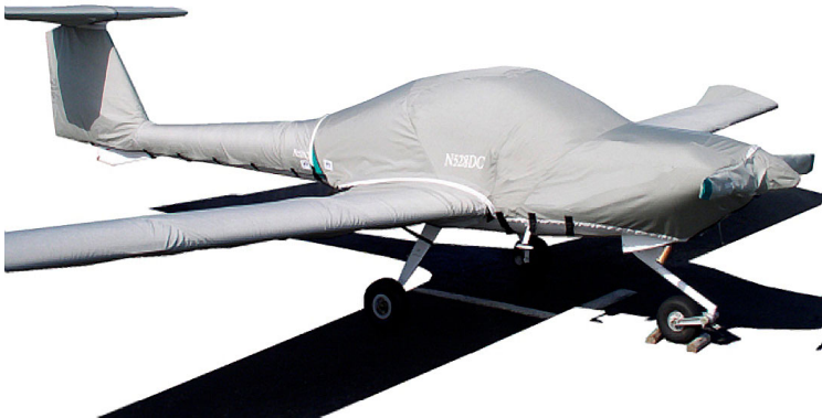
DA-20 Full Cover Set