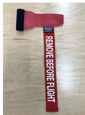
Pitot Tube Cover