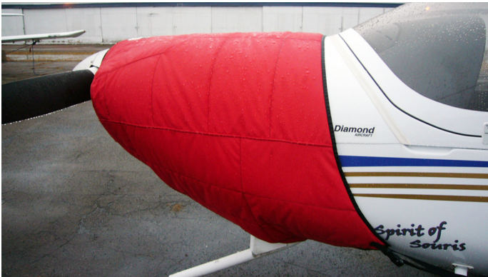
Diamond DA-20-C1 Insulated Engine Cover

This cover type is made from Silver Acrylic Sunbrella canvas and is 100% lined with a soft and smooth microfiber. Bruce's Custom Covers developed this material combination especially for aircraft protection. The outer material is medium weight and treated for water resistance, UV resistance and anti-static buildup. The inner lining is a very soft and smooth microfiber to prevent scratching. The material is very reflective, and tests show that the cabin interior temperature can be reduced to near-ambient temperature on the hottest of days. It is water, ice and snow repellent, yet breathable to allow moisture to escape from between the cover and the aircraft surface.