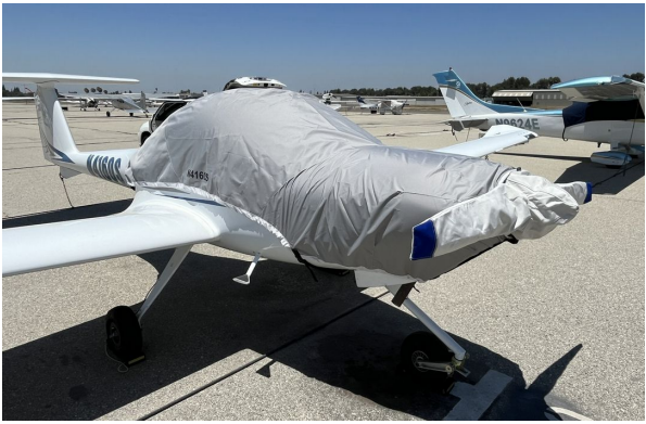
Diamond DA-20 Canopy/Engine Cover (Travel Weight), Prop Cover