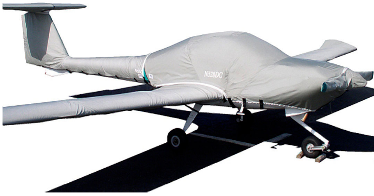
DA-20 Full Cover Set