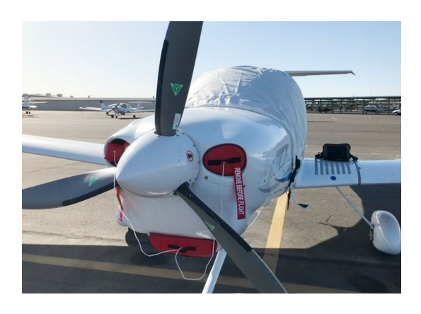
Diamond DA-40 NG Engine Plugs