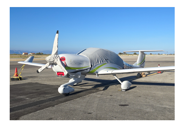
Diamond DA-40 Canopy & Prop Covers, Engine Plugs