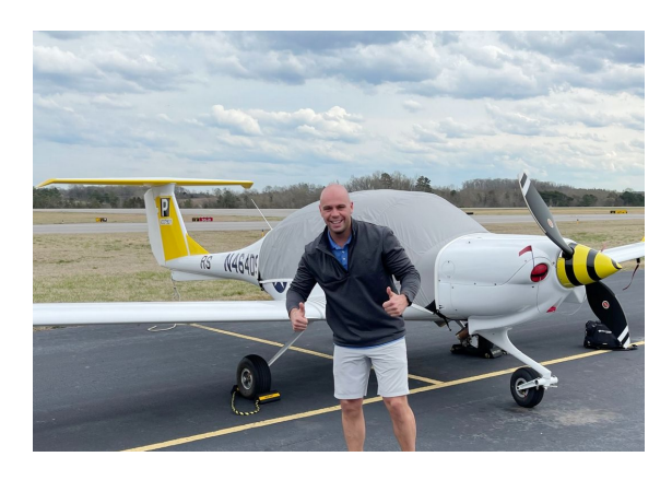
Diamond DA-40 Light Weight Travel Cover