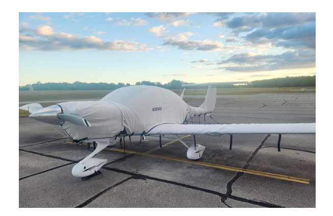
Diamond DA-40 Winter Cover Set

This cover type is made from Silver Acrylic Sunbrella canvas and is 100% lined with a soft and smooth microfiber. Bruce's Custom Covers developed this material combination especially for aircraft protection. The outer material is medium weight and treated for water resistance, UV resistance and anti-static buildup. The inner lining is a very soft and smooth microfiber to prevent scratching. The material is very reflective, and tests show that the cabin interior temperature can be reduced to near-ambient temperature on the hottest of days. It is water, ice and snow repellent, yet breathable to allow moisture to escape from between the cover and the aircraft surface.