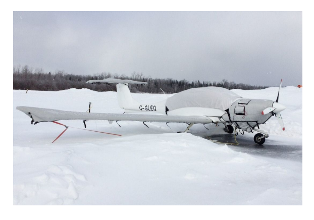
Diamond DA40 Canopy, Insulated Engine, Wing and Stab. Covers