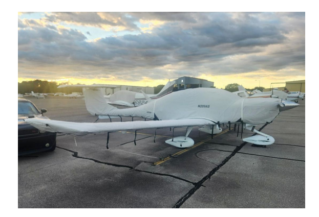
Diamond DA-40 Winter Cover Set

WINTER USE MATERIAL - Made with Solution-Dyed Polyester fabric, this option is intended for seasonal use to aid in deicing, rain mitigation, or for occasional travel. The material is lighter and more compact, but more susceptible to UV damage and may have a shorter useful life if used continuously outside than the all-year use material.