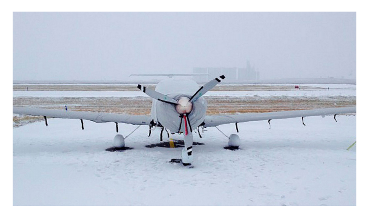
Diamond DA-40 Extended Canopy Cover, Wing Covers & Insulated Engine Cover