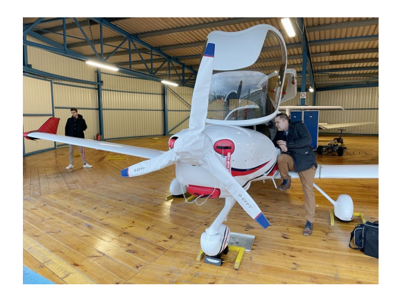
DA40 NG Engine Plugs