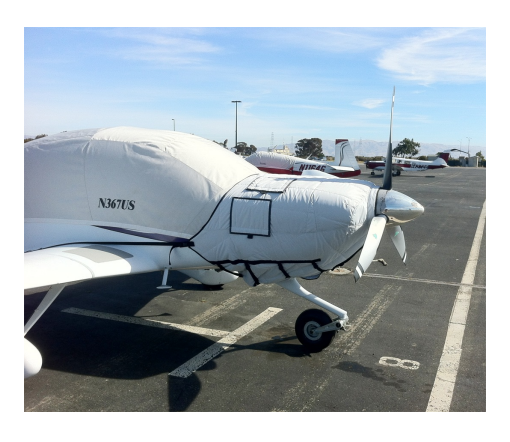
Diamond DA-40 Insulated Engine Cover, Silver/Grey