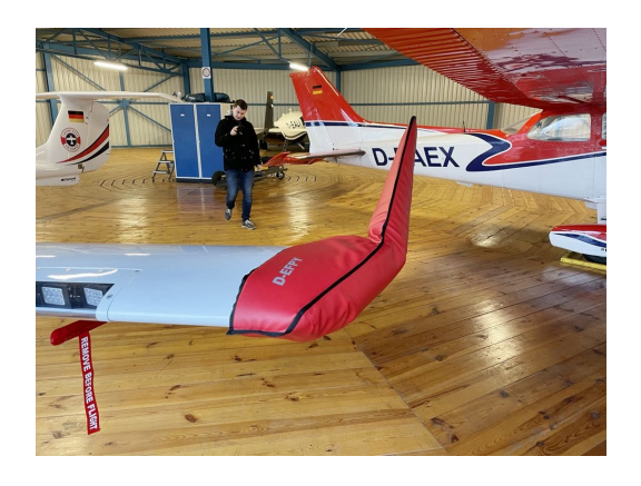
Diamond DA-40 Wingtip Pads

Designed to prevent damage to the aircraft extremities in crowded hangars, these products are made of bright red Naugahyde and thickly padded with a sandwich of closed cell foam.