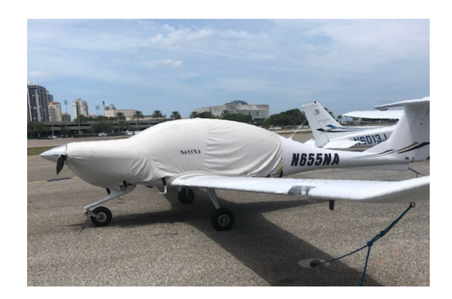
Diamond DA-40 Extended Canopy/Engine Cover