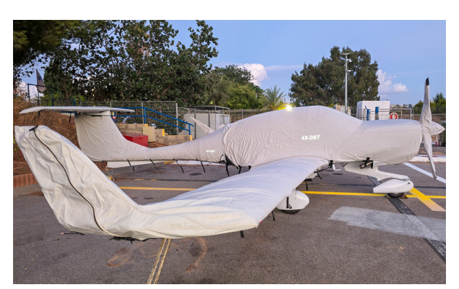
Diamond DA-40 Complete Cover Set