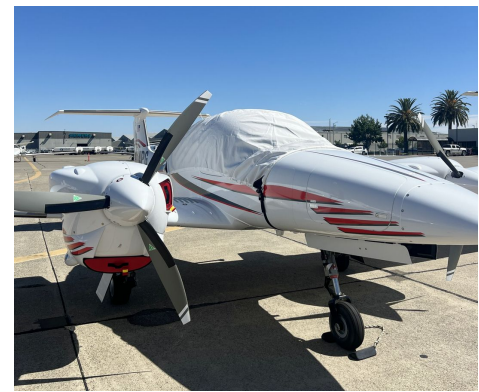
Diamond DA-42 Twin Star Canopy Cover