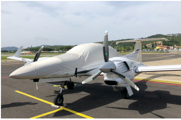
Diamond DA-42 Canopy/Nose Cover