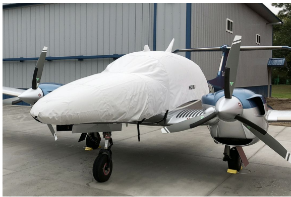
Diamond DA-62 Canopy/Nose Cover