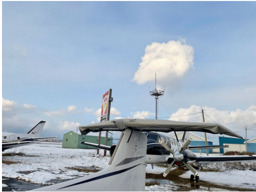
Diamond DA-42 Horizontal Stabilizer Cover

WINTER USE MATERIAL - Made with Solution-Dyed Polyester fabric, this option is intended for seasonal use to aid in deicing, rain mitigation, or for occasional travel. The material is lighter and more compact, but more susceptible to UV damage and may have a shorter useful life if used continuously outside than the all-year use material.