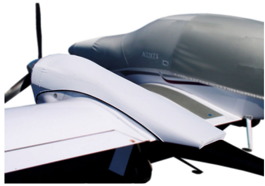
Twinstar Travel-Cover Engine Cover, 4 lbs. with bag