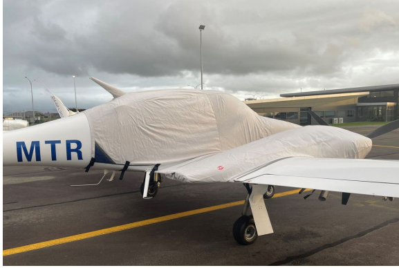
Diamond DA-42 Extended Canopy/Nose & Engine Covers

The material is very reflective, and tests show that the cabin interior temperature can be reduced to near-ambient temperature on the hottest of days. It is water, ice and snow repellent, yet breathable to allow moisture to escape from between the cover and the aircraft surface.