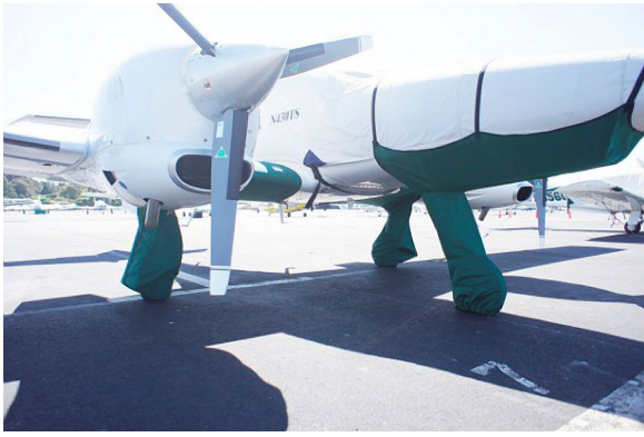
Twinstar Landing Gear & Gearwell Covers