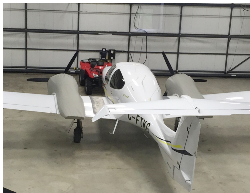
Diamond DA-42 Twinstar Engine Covers