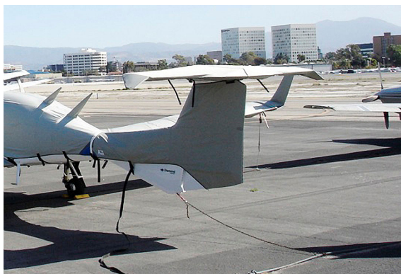
DA-42 Empennage & Horiz. Stab. Covers

WINTER USE MATERIAL - Made with Solution-Dyed Polyester fabric, this option is intended for seasonal use to aid in deicing, rain mitigation, or for occasional travel. The material is lighter and more compact, but more susceptible to UV damage and may have a shorter useful life if used continuously outside than the all-year use material.