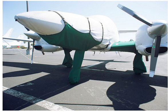
Diamond DA-42 Twinstar Landing Gear & Gearwell Covers