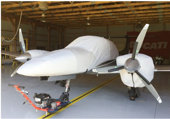
Diamond DA-42-VI Canopy/Nose & Engine Covers