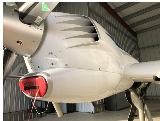
Diamond DA-42 Engine Inlet Plugs