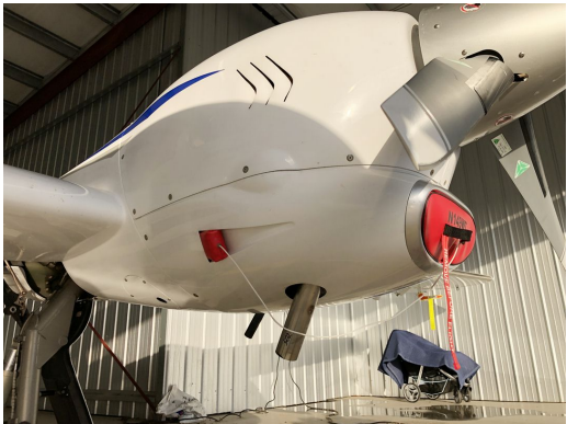
Diamond DA-42 Engine Inlet Plugs