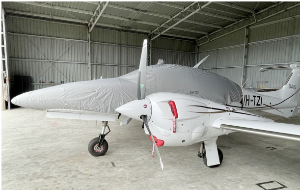
Diamond DA-62 Canopy/Nose Cover, Engine Plugs

Engine Inlet Plugs are custom fit for your Diamond DA-42 Twin Star intakes, made with heavy-duty vinyl material, and stuffed with a single block of sculpted urethane foam. Each plug has a zipper that allows the foam to be removed and dried if necessary. Engine plugs have warning flags that are visible from the cockpit or 'remove before flight' streamers sewn onto the face of the plugs. Most plugs are imprinted with the aircraft registration number in black for an extra charge. Storage bag NOT included. Engine plugs may be inserted after flight when the engine is still warm. Engine Inlet Plugs are commonly referred to as Cowl Plugs, Intake Plugs, Cowl Blocks, Engine Blocks, and Engine Bungs.