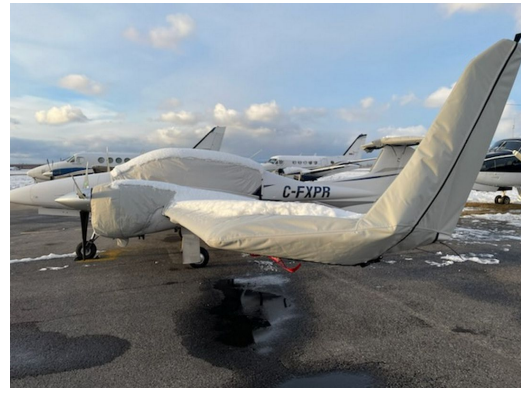
Diamond DA-42 Canopy, Wing, Engine & Horizontal Stabilizer Covers