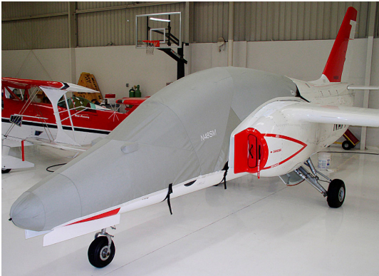
S-211 Canopy/Nose Cover & Engine Plugs

This cover type is made from Silver Acrylic Sunbrella canvas and is 100% lined with a soft and smooth microfiber. Bruce's Custom Covers developed this material combination especially for aircraft protection. The outer material is medium weight and treated for water resistance, UV resistance and anti-static buildup. The inner lining is a very soft and smooth microfiber to prevent scratching. The material is very reflective, and tests show that the cabin interior temperature can be reduced to near-ambient temperature on the hottest of days. It is water, ice and snow repellent, yet breathable to allow moisture to escape from between the cover and the aircraft surface.