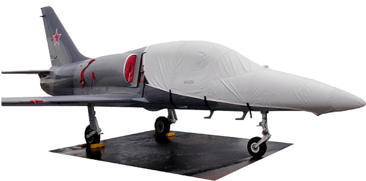
L-39 Canopy/Nose Cover & Plugs