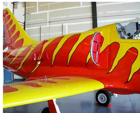
Inlet Plug, folding type