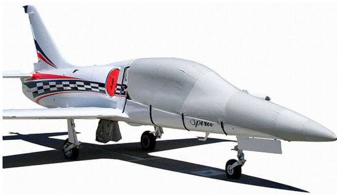
L39 Canopy/Nose Cover & Intake Plugs

This cover type is made from Silver Acrylic Sunbrella canvas and is 100% lined with a soft and smooth microfiber. Bruce's Custom Covers developed this material combination especially for aircraft protection. The outer material is medium weight and treated for water resistance, UV resistance and anti-static buildup. The inner lining is a very soft and smooth microfiber to prevent scratching. The material is very reflective, and tests show that the cabin interior temperature can be reduced to near-ambient temperature on the hottest of days. It is water, ice and snow repellent, yet breathable to allow moisture to escape from between the cover and the aircraft surface.