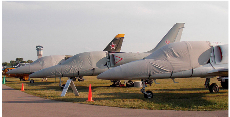
L-39 Canopy/Nose Covers & Plugs