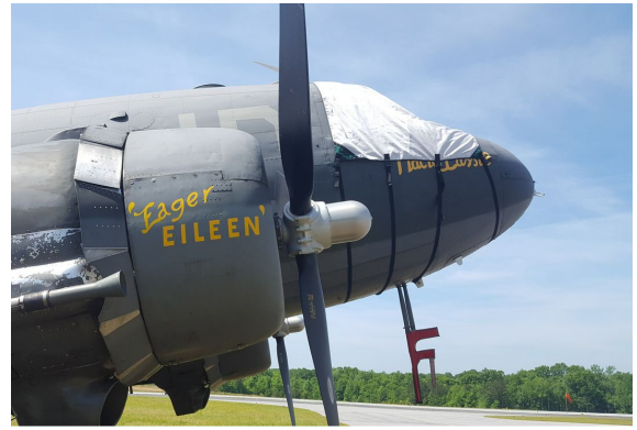
Douglas DC-3 Cockpit Cover