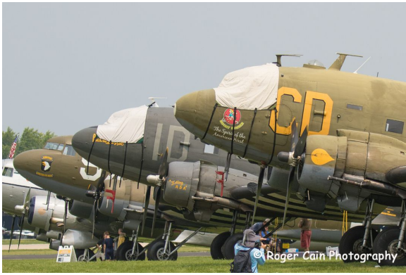
Douglas DC-3's with Cockpit Covers