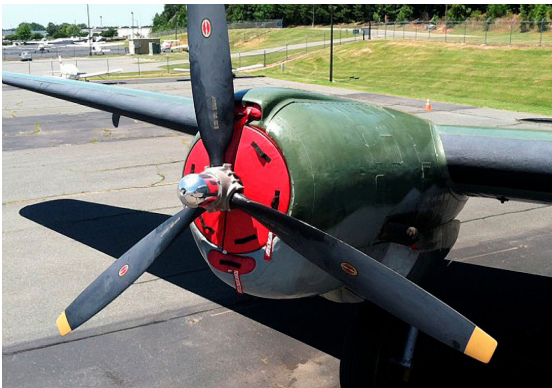
C-46 Radial Engine Intake Plug

Engine Inlet Plugs are custom fit for your Douglas DC-3 intakes, made with heavy-duty vinyl material, and stuffed with a single block of sculpted urethane foam. Each plug has a zipper that allows the foam to be removed and dried if necessary. Engine plugs have warning flags that are visible from the cockpit or 'remove before flight' streamers sewn onto the face of the plugs. Most plugs are imprinted with the aircraft registration number in black for an extra charge. Storage bag NOT included. Engine plugs may be inserted after flight when the engine is still warm. Engine Inlet Plugs are commonly referred to as Cowl Plugs, Intake Plugs, Cowl Blocks, Engine Blocks, and Engine Bungs.