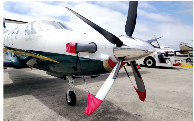
PC-12 Canopy Cover, Engine Plugs, Prop Tie/Exhaust Covers Main Intake Plug and Prop-Tie/Exhaust Covers. (Sold Separately)