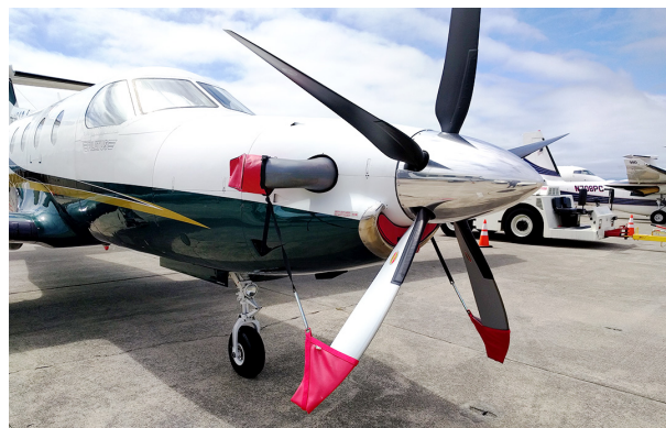
PC-12 Canopy Cover, Engine Plugs, Prop Tie/Exhaust Covers Main Intake Plug and Prop-Tie/Exhaust Covers. (Sold Separately)