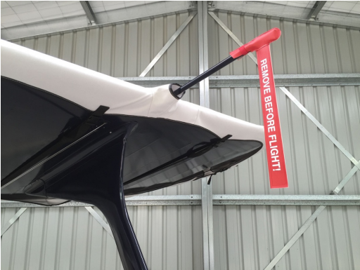
Beech Staggerwing Complete Cover Set, Upper Wing Detail

Howard DGA Models Pitot Tube Covers , NOT HEAT RESISTANT TYPE, are made of Naugahyde vinyl, and are designed to cover the entire pitot assembly. Slipping over the tube, the cover tightens around the base with a Velcro strap detail. A "Remove Before Flight" streamer is attached to the cover. Heat Resistant Pitot Covers are an upgrade to this design, and help prevent the pitot cover from melting onto the tube if the pitot heat is accidentally turned on while installed. If you want the set tethered together, please let us know.