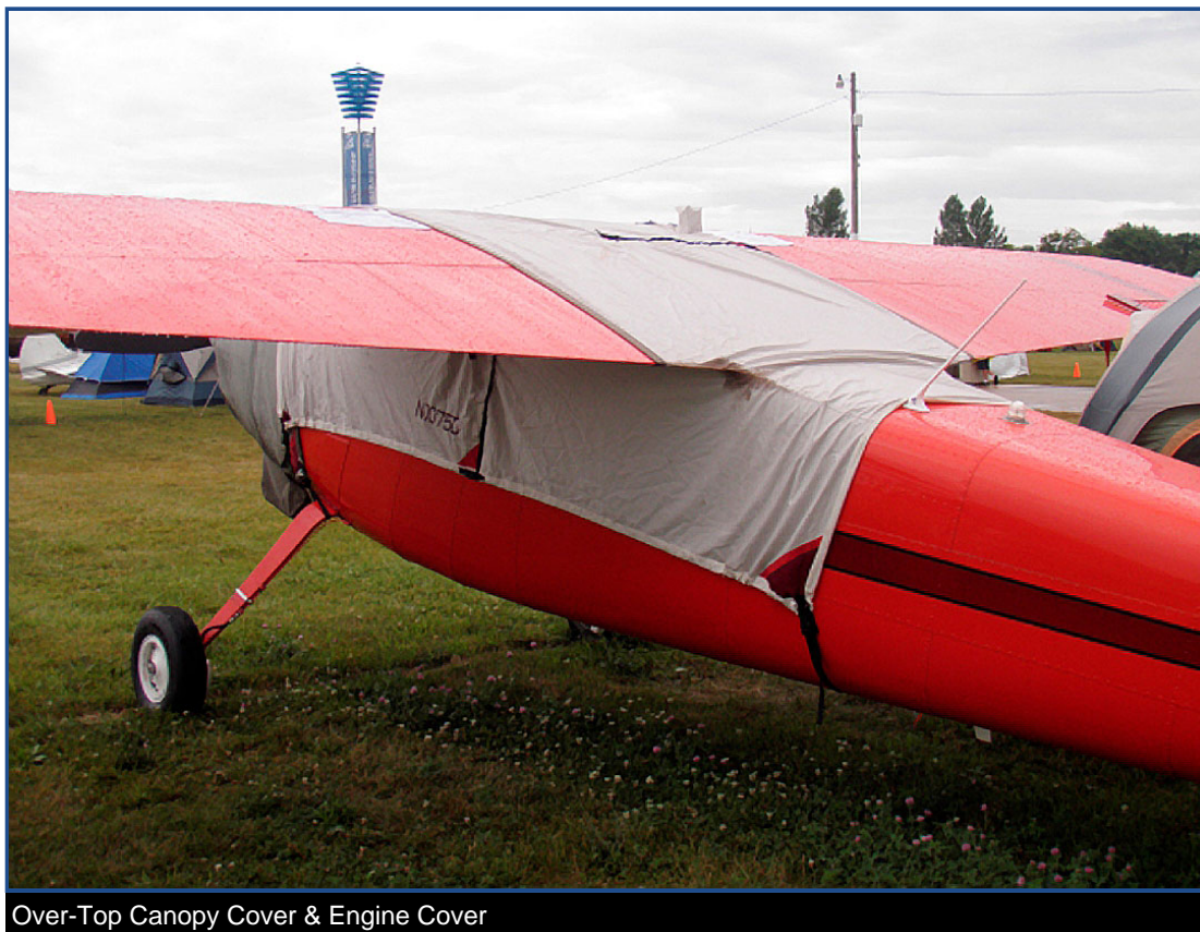
Over-Top Canopy Cover &amp; Engine Cover