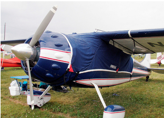
Cessna 195 Canopy Cover, extended forward and over gas caps Cessna 195 Canopy Cover, extended forward and over gas caps