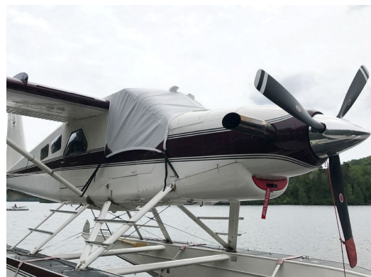
DeHavilland Turbo Beaver Cockpit Cover and Inlet Plug