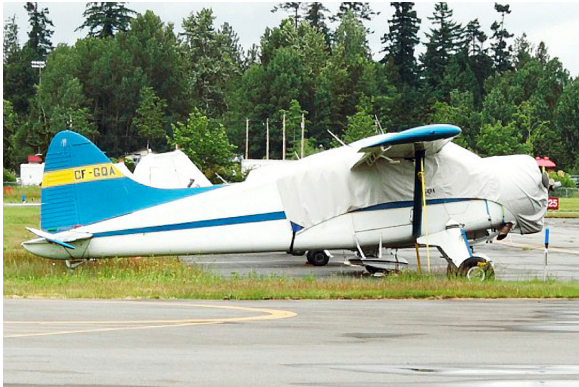
Beaver Canopy/Engine Cover

Travel Covers are made with Silver Solution-Dyed Polyester fabric and only lined over the windshield to save weight. The material is lightweight and more compact for easy stowage in the aircraft. The polyester material is water resistant, but only intended for occasional use outside. We also have an ultra lightweight material available for fitted hangar dust covers. For daily outdoor use, the non-travel Sunbrella Cover is the best choice.