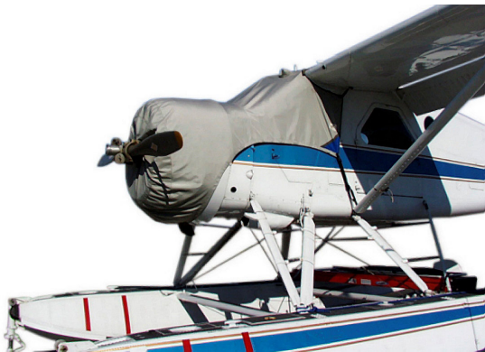
Beaver Windshield/Engine Cover

This cover type is made from Silver Acrylic Sunbrella canvas and is 100% lined with a soft and smooth microfiber. Bruce's Custom Covers developed this material combination especially for aircraft protection. The outer material is medium weight and treated for water resistance, UV resistance and anti-static buildup. The inner lining is a very soft and smooth microfiber to prevent scratching. The material is very reflective, and tests show that the cabin interior temperature can be reduced to near-ambient temperature on the hottest of days. It is water, ice and snow repellent, yet breathable to allow moisture to escape from between the cover and the aircraft surface.