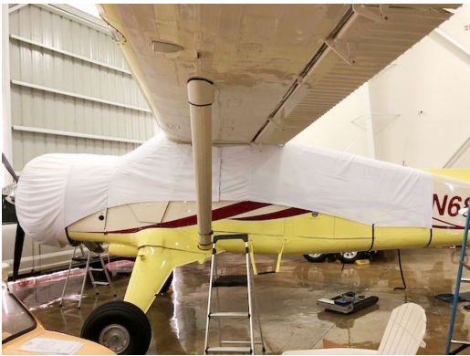
De Havilland Beaver Canopy/Engine Cover, test fit cover