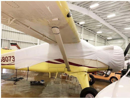
De Havilland Beaver Canopy/Engine Cover, test fit cover

This cover type is made from Silver Acrylic Sunbrella canvas and is 100% lined with a soft and smooth microfiber. Bruce's Custom Covers developed this material combination especially for aircraft protection. The outer material is medium weight and treated for water resistance, UV resistance and anti-static buildup. The inner lining is a very soft and smooth microfiber to prevent scratching. The material is very reflective, and tests show that the cabin interior temperature can be reduced to near-ambient temperature on the hottest of days. It is water, ice and snow repellent, yet breathable to allow moisture to escape from between the cover and the aircraft surface.