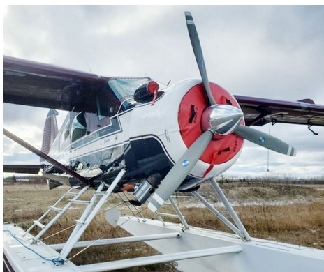
DeHavilland DH2 Beaver Engine Plugs

Engine Inlet Plugs are custom fit for your DeHavilland Beaver DHC-2, U-6A, U-6B intakes, made with heavy-duty vinyl material, and stuffed with a single block of sculpted urethane foam. Each plug has a zipper that allows the foam to be removed and dried if necessary. Engine plugs have warning flags that are visible from the cockpit or 'remove before flight' streamers sewn onto the face of the plugs. Most plugs are imprinted with the aircraft registration number in black for an extra charge. Storage bag NOT included. Engine plugs may be inserted after flight when the engine is still warm. Engine Inlet Plugs are commonly referred to as Cowl Plugs, Intake Plugs, Cowl Blocks, Engine Blocks, and Engine Bungs.