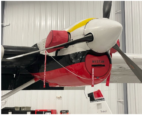
DeHavilland DH-6 Intake Plugs, Exhaust Covers