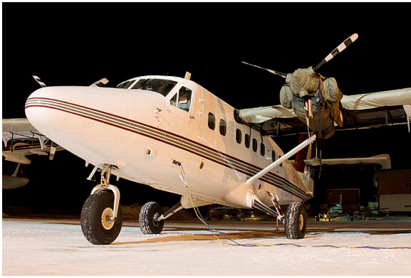
Twin Otter Wing, Horiz. Stab & Engine Covers