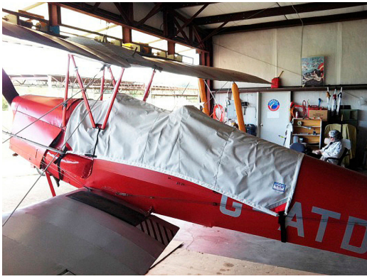
Canopy Cover for the De Havilland Tiger Moth