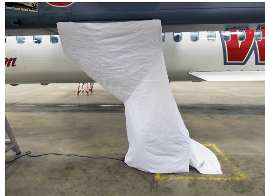
Q400, Main gear landing/tire covers - Cold Weather Ops