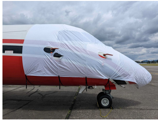
DeHavilland Dash 8, Q400 Cockpit/Nose Cover, test fit cover