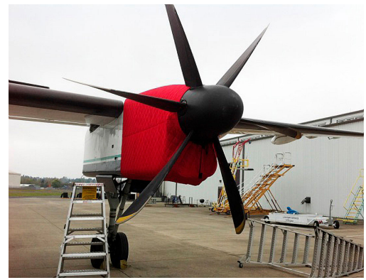
Dash 8-Q400 Insulated Engine Cover