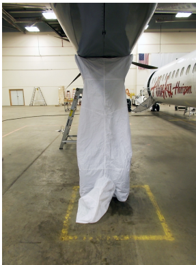
Q400, Main gear landing/tire covers - Cold Weather Ops

ALL-YEAR USE MATERIAL - Made with Silver Acrylic Sunbrella canvas, the all-year use material is the best option for sun protection and cover longevity. This heavier more durable material is intended for all weather conditions, such as rain and snow or lots of sun.