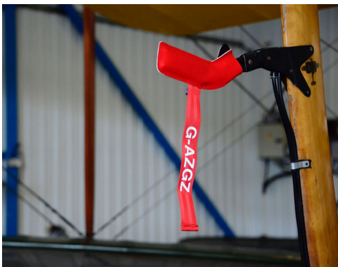
DeHavilland DH-82 Tiger Moth Pitot Cover

DeHavilland DH-82 Tiger Moth Pitot Tube Covers , NOT HEAT RESISTANT TYPE, are made of Naugahyde vinyl, and are designed to cover the entire pitot assembly. Slipping over the tube, the cover tightens around the base with a Velcro strap detail. A "Remove Before Flight" streamer is attached to the cover. Heat Resistant Pitot Covers are an upgrade to this design, and help prevent the pitot cover from melting onto the tube if the pitot heat is accidentally turned on while installed. If you want the set tethered together, please let us know.