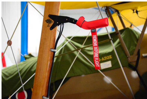
DeHavilland DH-82 Tiger Moth Pitot Cover

DeHavilland DH-82 Tiger Moth Pitot Tube Covers , NOT HEAT RESISTANT TYPE, are made of Naugahyde vinyl, and are designed to cover the entire pitot assembly. Slipping over the tube, the cover tightens around the base with a Velcro strap detail. A "Remove Before Flight" streamer is attached to the cover. Heat Resistant Pitot Covers are an upgrade to this design, and help prevent the pitot cover from melting onto the tube if the pitot heat is accidentally turned on while installed. If you want the set tethered together, please let us know.