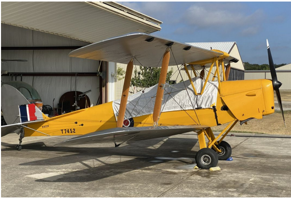
Dehavilland DH-82 Tiger Moth Canopy Cover