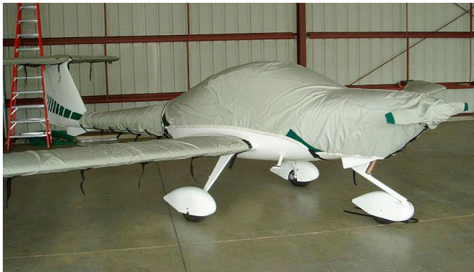
DA-20 Canopy/Engine, Prop/Spinner, Wing, Tailboom, Horiz. Stab. Covers