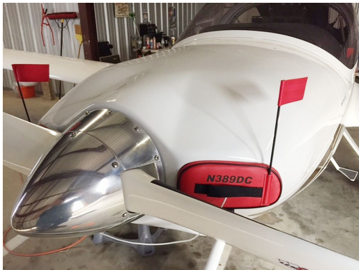
Diamond DA-20-C1 Engine Inlet Plugs

This cover type is made from Silver Acrylic Sunbrella canvas and is 100% lined with a soft and smooth microfiber. Bruce's Custom Covers developed this material combination especially for aircraft protection. The outer material is medium weight and treated for water resistance, UV resistance and anti-static buildup. The inner lining is a very soft and smooth microfiber to prevent scratching. The material is very reflective, and tests show that the cabin interior temperature can be reduced to near-ambient temperature on the hottest of days. It is water, ice and snow repellent, yet breathable to allow moisture to escape from between the cover and the aircraft surface.