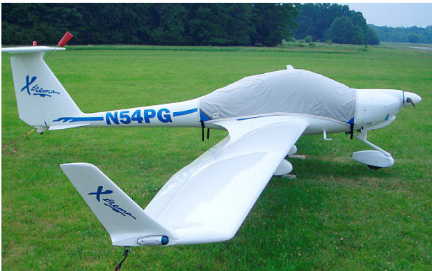
Dimona Xtreme Canopy Cover

The Diamond HK-36, Super Dimona & Extreme Canopy/Engine Cover is a one-piece cover (100% lined with microfiber) that is a combination of the Canopy Cover and Engine Cover. This cover will enclose the engine cowl and will extend aft to cover all of the windows. This cover type is made from Silver Acrylic Sunbrella canvas and is 100% lined with a soft and smooth microfiber. Bruce's Custom Covers developed this material combination especially for aircraft protection. The outer material is medium weight and treated for water resistance, UV resistance and anti-static buildup. The inner lining is a very soft and smooth microfiber to prevent scratching. The material is very reflective, and tests show that the cabin interior temperature can be reduced to near-ambient temperature on the hottest of days. It is water, ice and snow repellent, yet breathable to allow moisture to escape from between the cover and the aircraft surface.