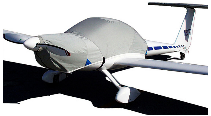
Diamond DA-20 Canopy/Engine Cover