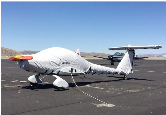
Dimona HK-36 Extended Canopy/Engine Cover, Empennage Cover Set