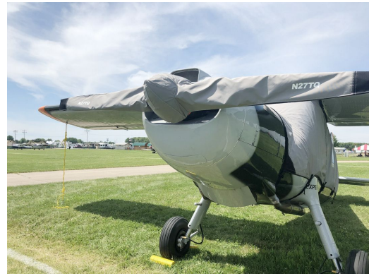
Dornier DO-27 Canopy Cover, Prop Cover