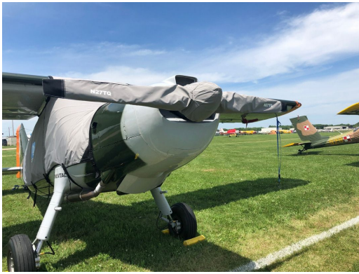
Dornier DO-27 Canopy Cover, Prop Cover