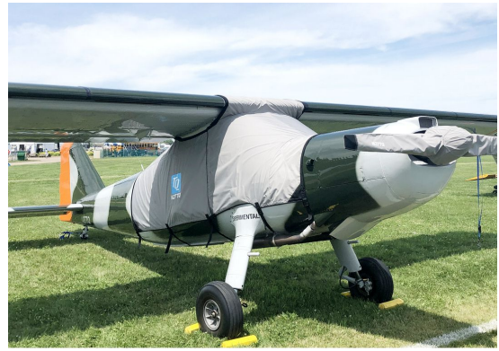
Dornier DO-27 Canopy Cover, Prop Cover