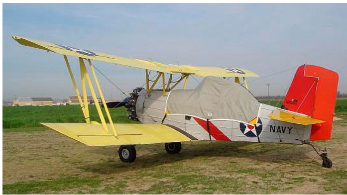
Grumman Ag Cat Canopy Cover