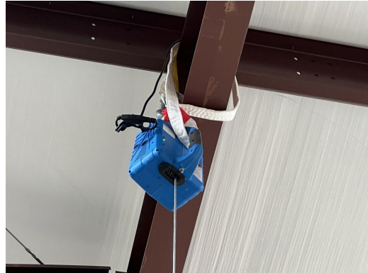
Stearman PT-13 Full Body Dust Cover, Remote Control Winch