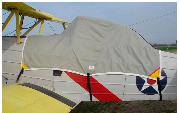
Grumman Ag Cat Canopy Cover