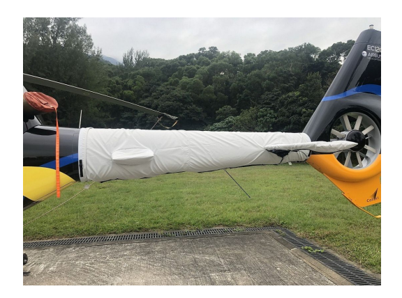
Eurocopter EC-120B Tailboom Cover

The Tailboom Cover details vary by model, but generally the helicopter tail boom cover encloses the tail boom from the "bottleneck" to the aft end. They usually also cover the horizontal stabilizers, and are custom made to allow for antennae, lights, and other protrusions. They attach with straps underneath the tail boom. Covers for the vertical and horizontal stabilizers are also available separately. Specific information for each model is available on request.