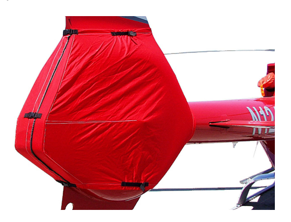
Euirocopter EC-120Tailfan Cover