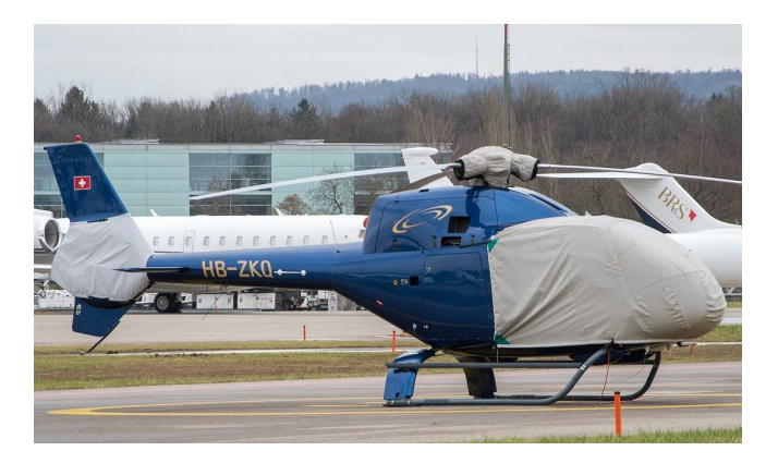
Eurocopter EC-120 Bubble, Rotor Mast & Tailfan Covers