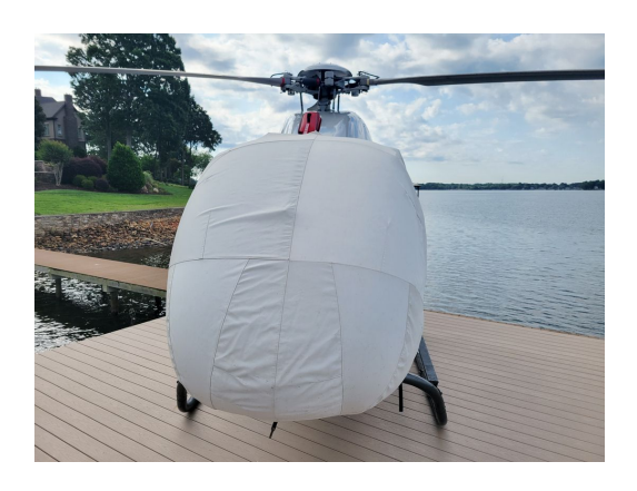
Eurocopter E120 Bubble Cover

This cover type is made from Silver Acrylic Sunbrella canvas and is 100% lined with a soft and smooth microfiber. Bruce's Custom Covers developed this material combination especially for aircraft protection. The outer material is medium weight and treated for water resistance, UV resistance and anti-static buildup. The inner lining is a very soft and smooth microfiber to prevent scratching. The material is very reflective, and tests show that the cabin interior temperature can be reduced to near-ambient temperature on the hottest of days. It is water, ice and snow repellent, yet breathable to allow moisture to escape from between the cover and the aircraft surface.