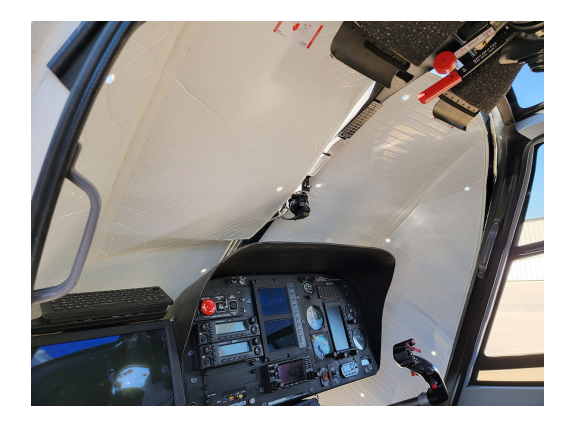
Eurocopter EC-120 Windshield HeatShields