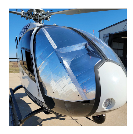
Eurocopter EC-120 Windshield HeatShields

Heatshields are interior sunshades for an aircraft's windows or canopy glass. The product is a unique composite of closed-cell foam with a silver mylar finish. The semi-rigid design is stiff enough to stand along the inside of the windshield using sun visors or window framing. It folds up flat and easily stores in the included storage sleeve. Some designs may require velcro and suction cups. A Heatshield is an excellent short-term remedy for cockpit overheating.