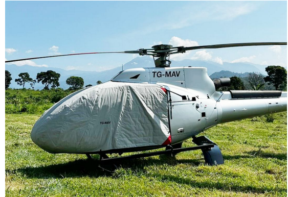
Airbus H-130 Insulated Bubble Cover