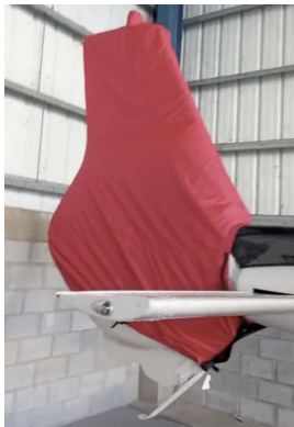
Eurocopter EC-130 Tailfan/Upper Vert Stab Housing Cover

The Tailboom Cover details vary by model, but generally the helicopter tail boom cover encloses the tail boom from the "bottleneck" to the aft end. They usually also cover the horizontal stabilizers, and are custom made to allow for antennae, lights, and other protrusions. They attach with straps underneath the tail boom. Covers for the vertical and horizontal stabilizers are also available separately. Specific information for each model is available on request.