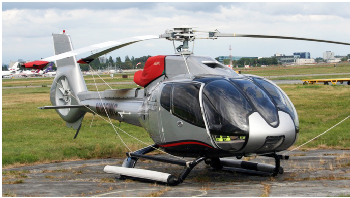
Intake/Exhaust Cover, Rotor Hub Cover (w/ skirt) & Blade Tie Downs