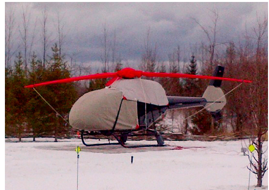
EC-130 Bubble, Engine, Rotor Hub, Blade & Tailfan Covers