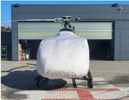
Airbus Helicopter H-130 Bubble Cover, Extends To Cover Fwd Engine Inlet

This cover type is made from Silver Acrylic Sunbrella canvas and is 100% lined with a soft and smooth microfiber. Bruce's Custom Covers developed this material combination especially for aircraft protection. The outer material is medium weight and treated for water resistance, UV resistance and anti-static buildup. The inner lining is a very soft and smooth microfiber to prevent scratching. The material is very reflective, and tests show that the cabin interior temperature can be reduced to near-ambient temperature on the hottest of days. It is water, ice and snow repellent, yet breathable to allow moisture to escape from between the cover and the aircraft surface.