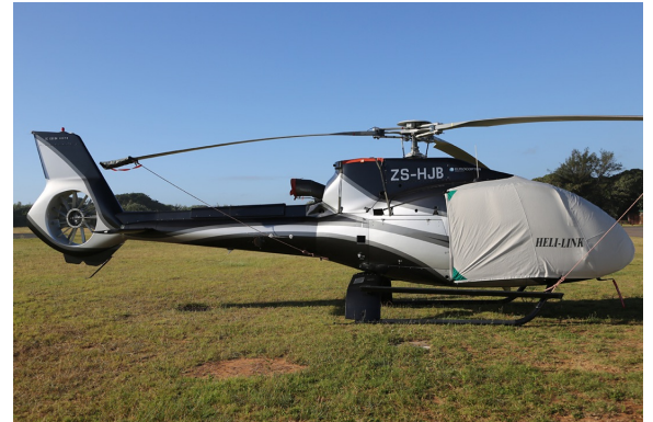
EC-130 Bubble Cover