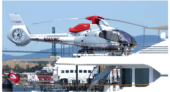
Intake/Exhaust Cover & Rotor Hub Cover (w/ skirt)