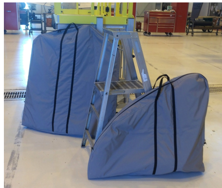
Eurocopter EC-145 Padded Bags for Removable Doors