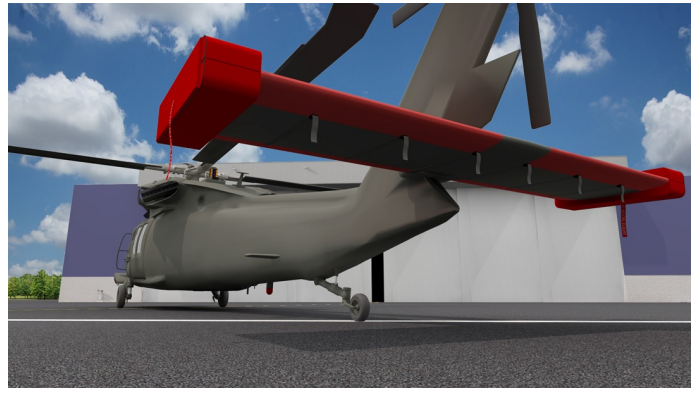
Padded Horizontal Stab Covers, Wingtip Pads (illustration)