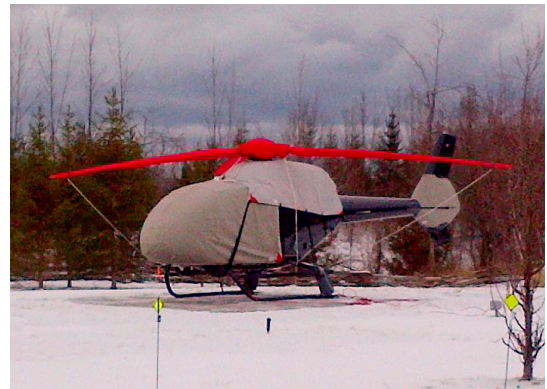
EC-130 Bubble, Engine, Rotor Hub, Blade & Tailfan Covers