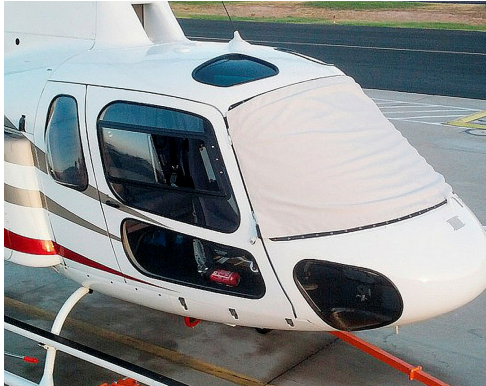
AS350 Windshield Cover, pinches in door jambs

This cover type is made from Silver Acrylic Sunbrella canvas and is 100% lined with a soft and smooth microfiber. Bruce's Custom Covers developed this material combination especially for aircraft protection. The outer material is medium weight and treated for water resistance, UV resistance and anti-static buildup. The inner lining is a very soft and smooth microfiber to prevent scratching. The material is very reflective, and tests show that the cabin interior temperature can be reduced to near-ambient temperature on the hottest of days. It is water, ice and snow repellent, yet breathable to allow moisture to escape from between the cover and the aircraft surface.