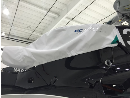
EC-130 Engine Area/Exhaust Cover

tight at the blade root with straps and quick-release plastic buckles. The Cold Weather Blade Covers are fitted with full-length zippers and optional deice “boots” designed to accept a preheater hose; a small opening at the tip of the cover allows for some air circulation and drainage in freezing weather. Some part numbers have features for an extra charge.