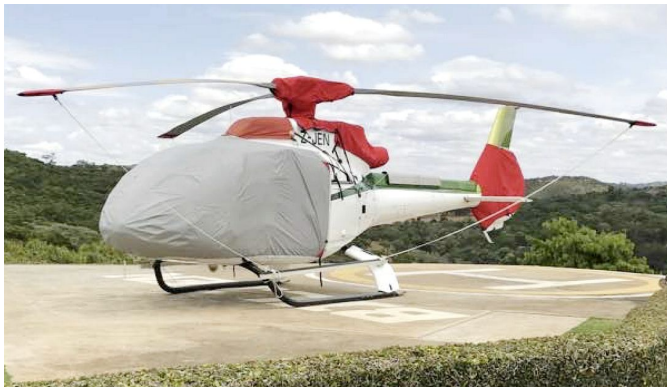
EC130 Bubble, Intake, Exhaust, Rotor Hub & Tailfan Covers

This cover type is made from Silver Acrylic Sunbrella canvas and is 100% lined with a soft and smooth microfiber. Bruce's Custom Covers developed this material combination especially for aircraft protection. The outer material is medium weight and treated for water resistance, UV resistance and anti-static buildup. The inner lining is a very soft and smooth microfiber to prevent scratching. The material is very reflective, and tests show that the cabin interior temperature can be reduced to near-ambient temperature on the hottest of days. It is water, ice and snow repellent, yet breathable to allow moisture to escape from between the cover and the aircraft surface.