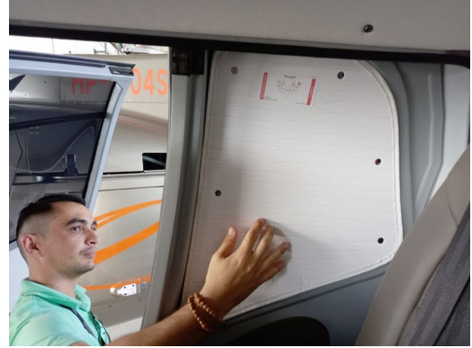
Airbus Helicopter EC130 B4 Side Window Heatshields