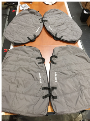
MD 500D Padded Door Bags

**Padded Door Bags* are designed to provide portable protection of the doors when they are removed from the aircraft. They are padded to moderate thickness, zippered closed, and have sturdy carry handles for easy transport.