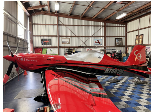
Gamebird GB-1 Solar Cap (single place), CUSTOM COVERS & IMPRINTING AVAILABLE!