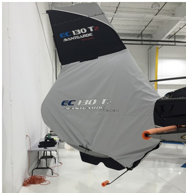
EC-130 Tailfan Cover

The Tailboom Cover details vary by model, but generally the helicopter tail boom cover encloses the tail boom from the "bottleneck" to the aft end. They usually also cover the horizontal stabilizers, and are custom made to allow for antennae, lights, and other protrusions. They attach with straps underneath the tail boom. Covers for the vertical and horizontal stabilizers are also available separately. Specific information for each model is available on request.