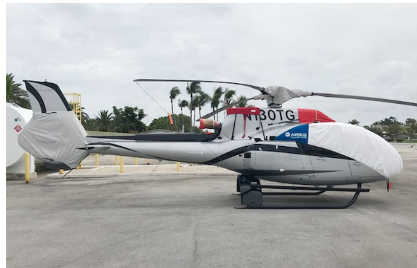
AIRBUS H130 T2, Intake, Exhaust & Tailfan Covers