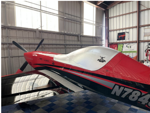
Gamebird GB-1 Solar Cap (single place), CUSTOM COVERS & IMPRINTING AVAILABLE!

This cover type is made from Silver Acrylic Sunbrella canvas and is 100% lined with a soft and smooth microfiber. Bruce's Custom Covers developed this material combination especially for aircraft protection. The outer material is medium weight and treated for water resistance, UV resistance and anti-static buildup. The inner lining is a very soft and smooth microfiber to prevent scratching. The material is very reflective, and tests show that the cabin interior temperature can be reduced to near-ambient temperature on the hottest of days. It is water, ice and snow repellent, yet breathable to allow moisture to escape from between the cover and the aircraft surface.