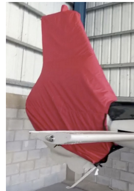
Eurocopter EC-130 Tailfan/Upper Vert Stab Housing Cover