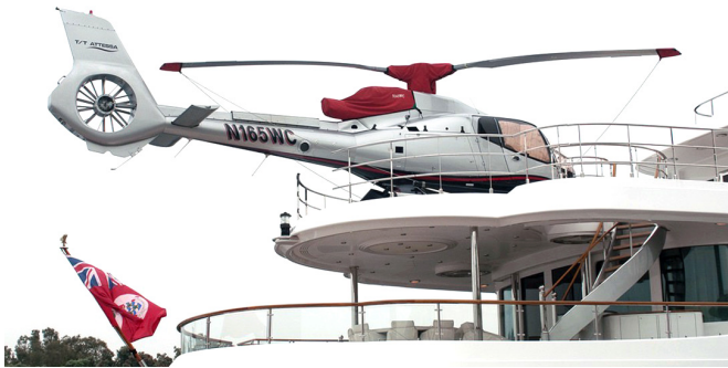
Intake/Exhaust Cover, Rotor Hub Cover (w/ skirt) & Blade Tie Downs

zippers and optional deice “boots” designed to accept a preheater hose; a small opening at the tip of the cover allows for some air circulation and drainage in freezing weather. Some part numbers have features for an extra charge.