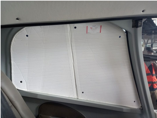
Airbus Helicopter EC130 B4 Side Window Heatshields