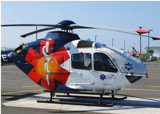
Eurocopter EC-135 Windshield/Skylight Cover

This cover type is made from Silver Acrylic Sunbrella canvas and is 100% lined with a soft and smooth microfiber. Bruce's Custom Covers developed this material combination especially for aircraft protection. The outer material is medium weight and treated for water resistance, UV resistance and anti-static buildup. The inner lining is a very soft and smooth microfiber to prevent scratching. The material is very reflective, and tests show that the cabin interior temperature can be reduced to near-ambient temperature on the hottest of days. It is water, ice and snow repellent, yet breathable to allow moisture to escape from between the cover and the aircraft surface.