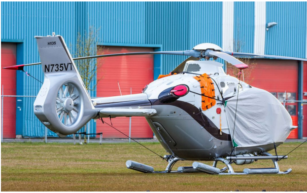
Airbus EC135T3 Blade Tie-Downs