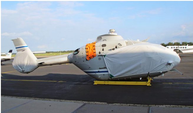
Bubble Cover and Tailfan Cover

The Tailboom Cover details vary by model, but generally the helicopter tail boom cover encloses the tail boom from the "bottleneck" to the aft end. They usually also cover the horizontal stabilizers, and are custom made to allow for antennae, lights, and other protrusions. They attach with straps underneath the tail boom. Covers for the vertical and horizontal stabilizers are also available separately. Specific information for each model is available on request.