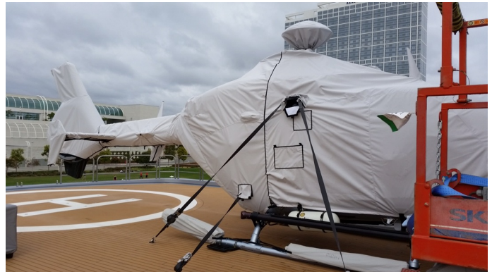
EC-135 Full Cover Set