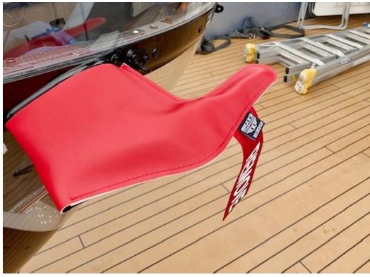
Airbus Helicopter H145 Pitot Tube Cover