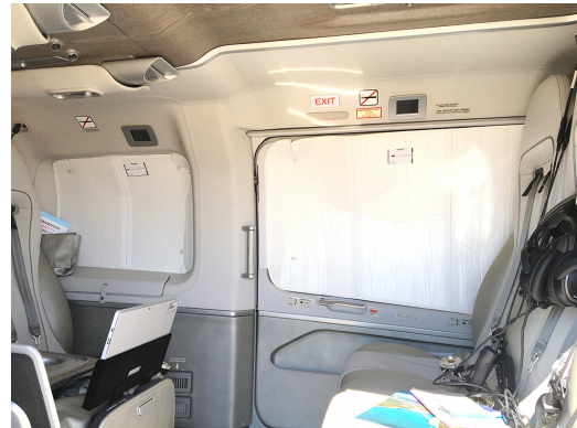
Eurocopter EC-145 Cabin Heatshields