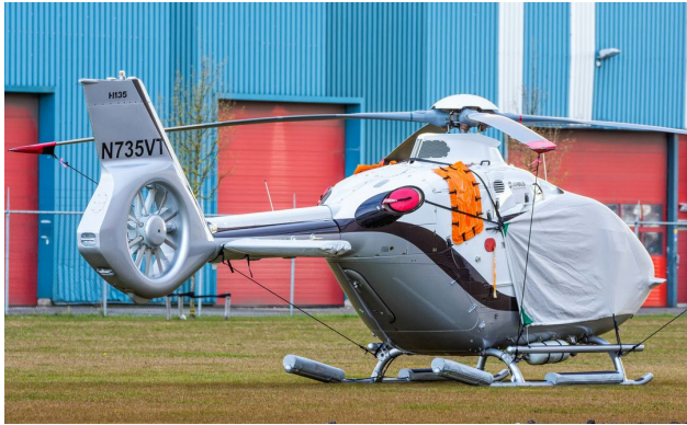
Airbus EC135T3 Blade Tie-Downs

The Eurocopter EC-135 Intake Cover . Details vary by model, but generally helicopter intake covers are designed to enclose the intake area only. They are smaller than helicopter engine covers, and their attachment details can vary from straps, to snaps, or some combination of the two. Specific information for each model is available on request.