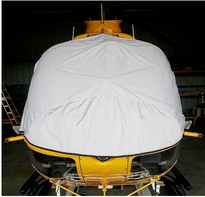
EC-135 Windshield/Skylights Cover, pinches in door jambs

This cover type is made from Silver Acrylic Sunbrella canvas and is 100% lined with a soft and smooth microfiber. Bruce's Custom Covers developed this material combination especially for aircraft protection. The outer material is medium weight and treated for water resistance, UV resistance and anti-static buildup. The inner lining is a very soft and smooth microfiber to prevent scratching. The material is very reflective, and tests show that the cabin interior temperature can be reduced to near-ambient temperature on the hottest of days. It is water, ice and snow repellent, yet breathable to allow moisture to escape from between the cover and the aircraft surface.