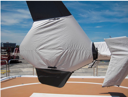
EC-135 Tailfan Cover and Tailboom Stabilizer Cover

The Tailboom Cover details vary by model, but generally the helicopter tail boom cover encloses the tail boom from the "bottleneck" to the aft end. They usually also cover the horizontal stabilizers, and are custom made to allow for antennae, lights, and other protrusions. They attach with straps underneath the tail boom. Covers for the vertical and horizontal stabilizers are also available separately. Specific information for each model is available on request.