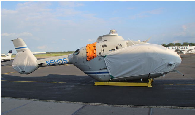
Eurocopter EC-135 Bubble & Tailfan Covers