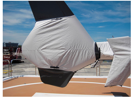
EC-135 Tailfan Cover and Tailboom Stabilizer Cover