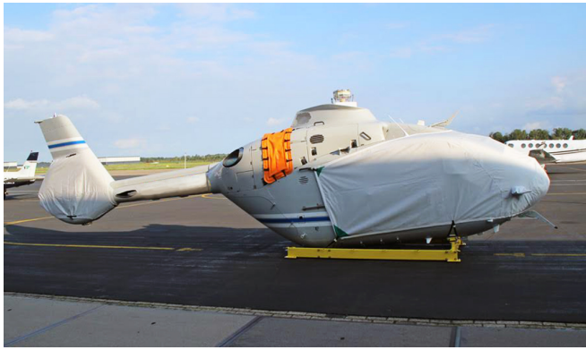
Bubble Cover and Tailfan Cover