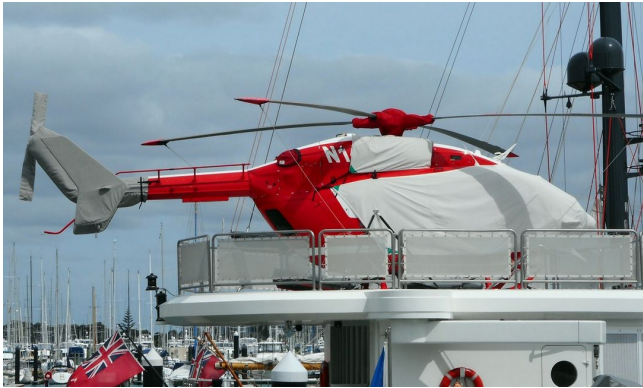
Eurocopter EC-135 Bubble, Engine, Rotor Hub, Tail Surfaces Covers