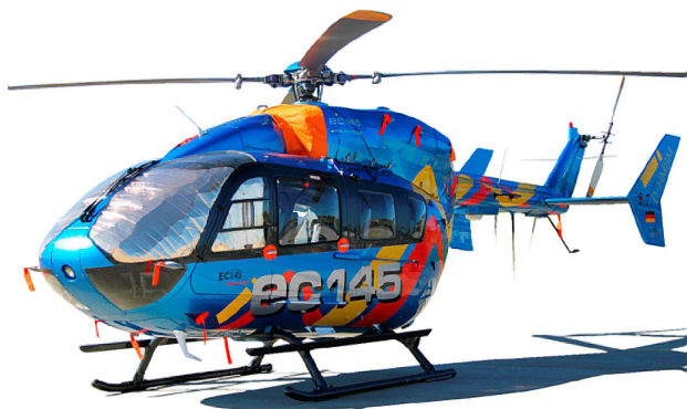
EC-145 Cabin Heatshield Set

Heatshields are interior sunshades for an aircraft's windows or canopy glass. The product is a unique composite of closed-cell foam with a silver mylar finish. The semi-rigid design is stiff enough to stand along the inside of the windshield using sun visors or window framing. It folds up flat and easily stores in the included storage sleeve. Some designs may require velcro and suction cups. A Heatshield is an excellent short-term remedy for cockpit overheating.