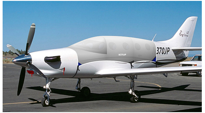
Epic LT Canopy Cover & Engine Plugs