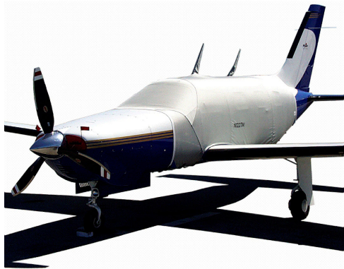
Piper Malibu/Mirage/Meridian Extended Canopy Cover

This cover type is made from Silver Acrylic Sunbrella canvas and is 100% lined with a soft and smooth microfiber. Bruce's Custom Covers developed this material combination especially for aircraft protection. The outer material is medium weight and treated for water resistance, UV resistance and anti-static buildup. The inner lining is a very soft and smooth microfiber to prevent scratching. The material is very reflective, and tests show that the cabin interior temperature can be reduced to near-ambient temperature on the hottest of days. It is water, ice and snow repellent, yet breathable to allow moisture to escape from between the cover and the aircraft surface.