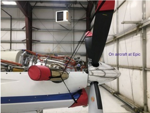
Epic E1000 Prop Tie/Exhaust Covers, Intake Cover, Windshield HeatShields