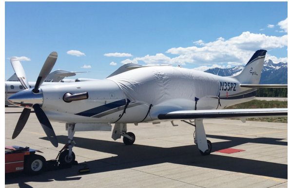
Epic LT Canopy Cover