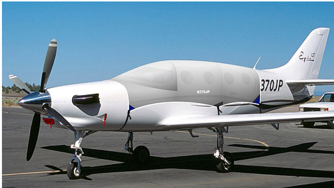
Epic LT Canopy Cover & Engine Plugs

This cover type is made from Silver Acrylic Sunbrella canvas and is 100% lined with a soft and smooth microfiber. Bruce's Custom Covers developed this material combination especially for aircraft protection. The outer material is medium weight and treated for water resistance, UV resistance and anti-static buildup. The inner lining is a very soft and smooth microfiber to prevent scratching. The material is very reflective, and tests show that the cabin interior temperature can be reduced to near-ambient temperature on the hottest of days. It is water, ice and snow repellent, yet breathable to allow moisture to escape from between the cover and the aircraft surface.