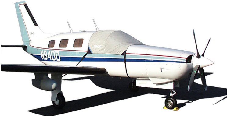
Piper Malibu/Mirage Windshield Cover