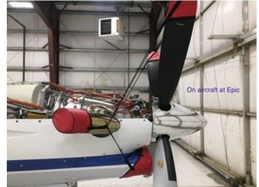
Epic E1000 Prop Tie/Exhaust Covers, Intake Cover, Windshield HeatShields