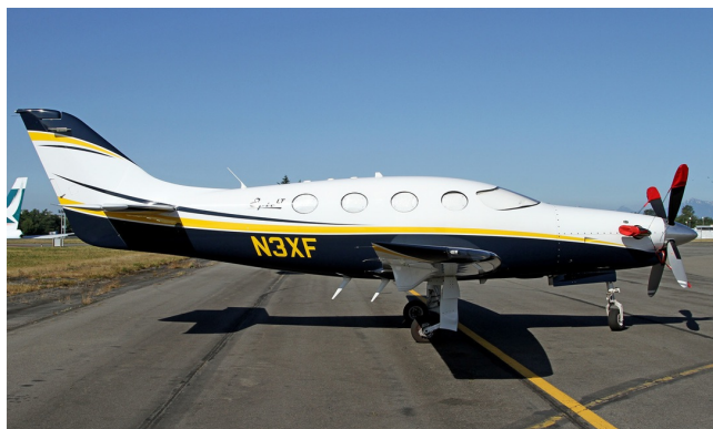
Epic LT Cockpit & Cabin HeatShields

This cover type is made from Silver Acrylic Sunbrella canvas and is 100% lined with a soft and smooth microfiber. Bruce's Custom Covers developed this material combination especially for aircraft protection. The outer material is medium weight and treated for water resistance, UV resistance and anti-static buildup. The inner lining is a very soft and smooth microfiber to prevent scratching. The material is very reflective, and tests show that the cabin interior temperature can be reduced to near-ambient temperature on the hottest of days. It is water, ice and snow repellent, yet breathable to allow moisture to escape from between the cover and the aircraft surface.