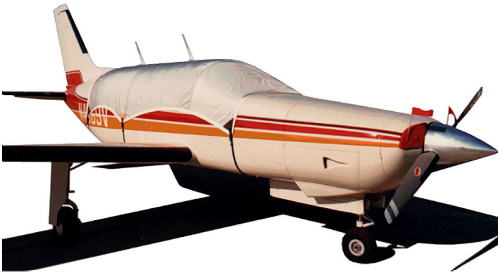
Malibu/Mirage/Meridian Standard Canopy Cover