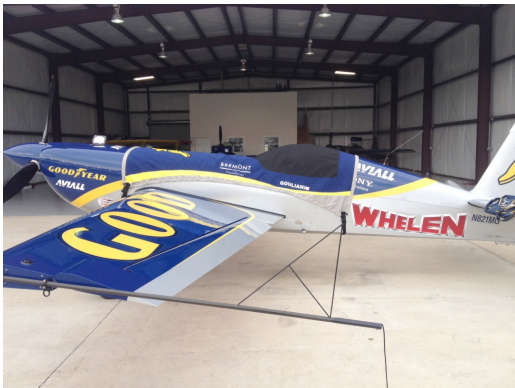
Extra 300SC with NASCAR style custom cover

This cover type is made from Silver Acrylic Sunbrella canvas and is 100% lined with a soft and smooth microfiber. Bruce's Custom Covers developed this material combination especially for aircraft protection. The outer material is medium weight and treated for water resistance, UV resistance and anti-static buildup. The inner lining is a very soft and smooth microfiber to prevent scratching. The material is very reflective, and tests show that the cabin interior temperature can be reduced to near-ambient temperature on the hottest of days. It is water, ice and snow repellent, yet breathable to allow moisture to escape from between the cover and the aircraft surface.