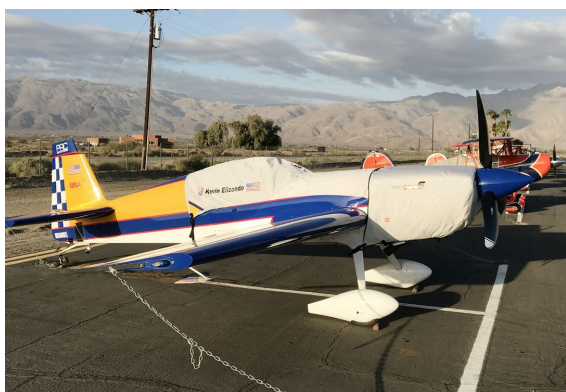
Extra 300S Canopy & Engine Covers

This cover type is made from Silver Acrylic Sunbrella canvas and is 100% lined with a soft and smooth microfiber. Bruce's Custom Covers developed this material combination especially for aircraft protection. The outer material is medium weight and treated for water resistance, UV resistance and anti-static buildup. The inner lining is a very soft and smooth microfiber to prevent scratching. The material is very reflective, and tests show that the cabin interior temperature can be reduced to near-ambient temperature on the hottest of days. It is water, ice and snow repellent, yet breathable to allow moisture to escape from between the cover and the aircraft surface.