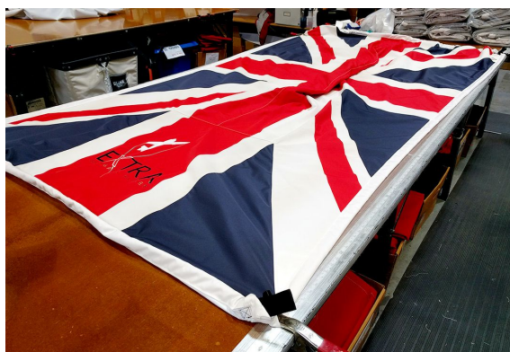
Custom Full-Cover Artwork