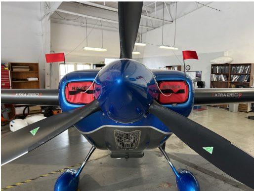
Extra 260 Engine Inlet Plugs