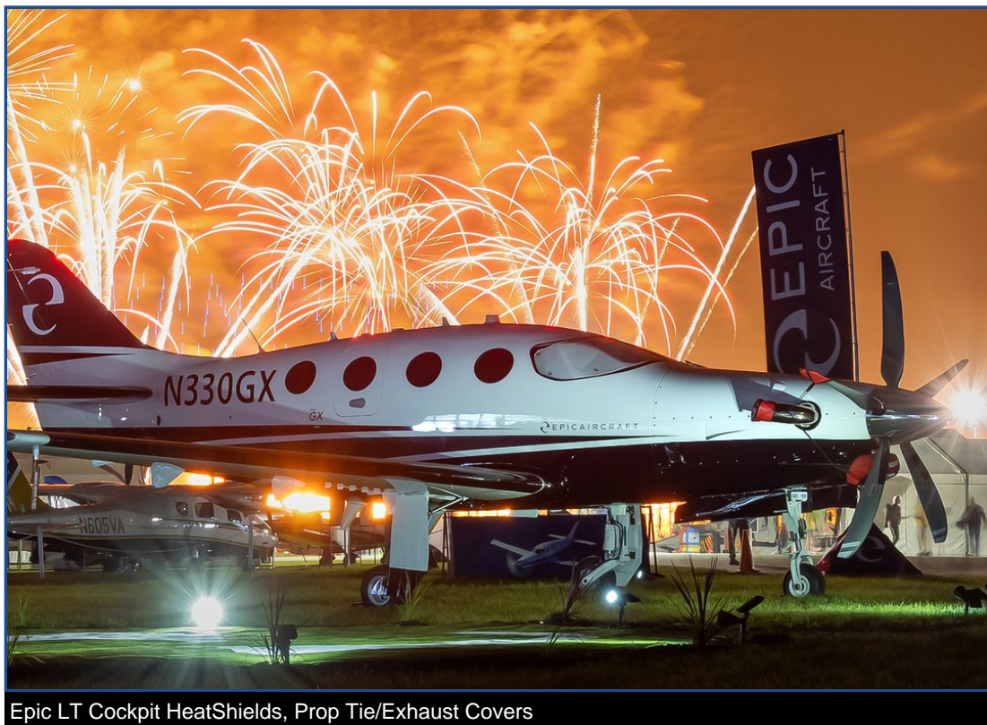
Epic LT Cockpit HeatShields, Prop Tie/Exhaust Covers