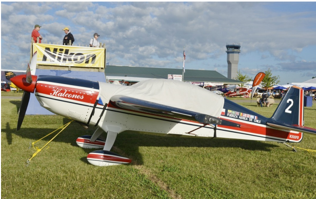
Extra 300 (mid-fuselage wing) Canopy Cover