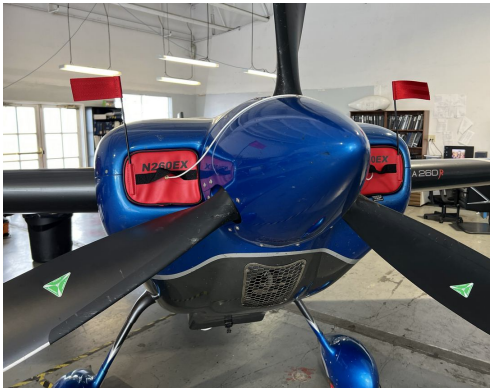
Extra 260 Engine Inlet Plugs

Engine Inlet Plugs are custom fit for your Extra 300, 330SC, 330SX & 200/230 Models intakes, made with heavy-duty vinyl material, and stuffed with a single block of sculpted urethane foam. Each plug has a zipper that allows the foam to be removed and dried if necessary. Engine plugs have warning flags that are visible from the cockpit or 'remove before flight' streamers sewn onto the face of the plugs. Most plugs are imprinted with the aircraft registration number in black for an extra charge. Storage bag NOT included. Engine plugs may be inserted after flight when the engine is still warm. Engine Inlet Plugs are commonly referred to as Cowl Plugs, Intake Plugs, Cowl Blocks, Engine Blocks, and Engine Bungs.