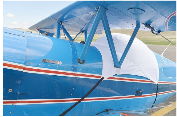
Acro Sport Canopy Cover