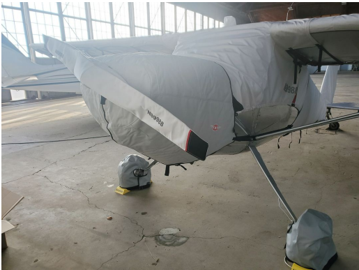
Cessna 140 Canopy, Wings, Prop, Tires & Empennage Covers

WINTER USE MATERIAL - Made with Solution-Dyed Polyester fabric, this option is intended for seasonal use to aid in deicing, rain mitigation, or for occasional travel. The material is lighter and more compact, but more susceptible to UV damage and may have a shorter useful life if used continuously outside than the all-year use material.