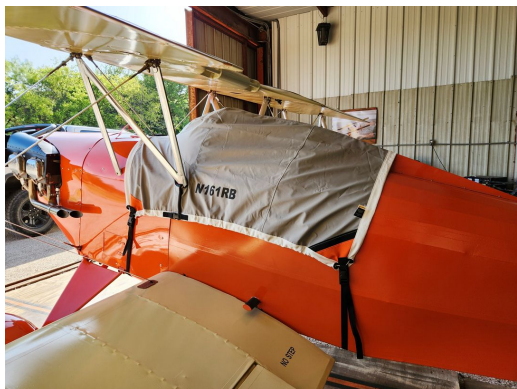
Burt Special Canopy Cover

This cover type is made from Silver Acrylic Sunbrella canvas and is 100% lined with a soft and smooth microfiber. Bruce's Custom Covers developed this material combination especially for aircraft protection. The outer material is medium weight and treated for water resistance, UV resistance and anti-static buildup. The inner lining is a very soft and smooth microfiber to prevent scratching. The material is very reflective, and tests show that the cabin interior temperature can be reduced to near-ambient temperature on the hottest of days. It is water, ice and snow repellent, yet breathable to allow moisture to escape from between the cover and the aircraft surface.