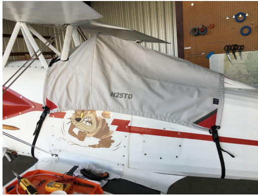
Lil Toot Canopy Cover

the hottest of days. It is water, ice and snow repellent, yet breathable to allow moisture to escape from between the cover and the aircraft surface.