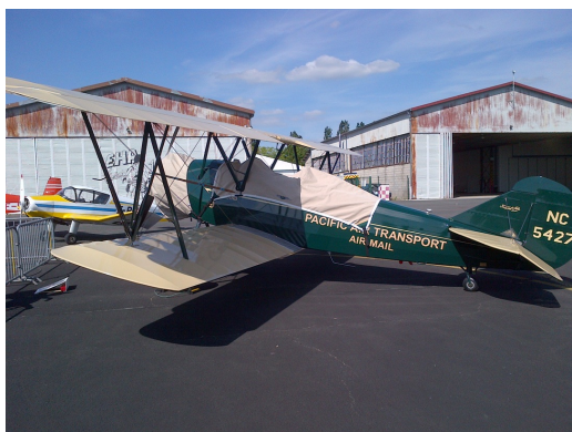
Travelair 4000 Canopy and Engine Cover