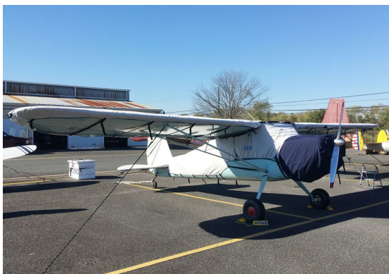
Cessna 140 Canopy, Engine, Wing & Empennage Covers

WINTER USE MATERIAL - Made with Solution-Dyed Polyester fabric, this option is intended for seasonal use to aid in deicing, rain mitigation, or for occasional travel. The material is lighter and more compact, but more susceptible to UV damage and may have a shorter useful life if used continuously outside than the all-year use material.