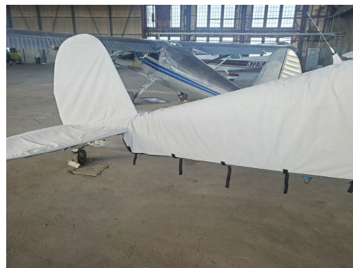
Cessna 140 Empennage Cover