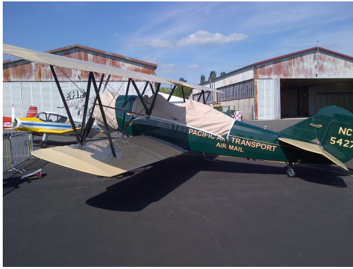
Travelair 4000 Canopy and Engine Cover

the hottest of days. It is water, ice and snow repellent, yet breathable to allow moisture to escape from between the cover and the aircraft surface.