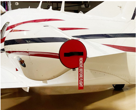
Eclipse EA500 Intake/Exhaust Plugs