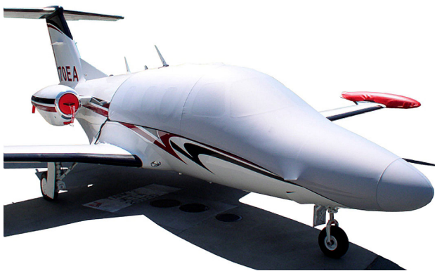
Hangar Dust, Canopy/Nose Cover, Engine Plugs & Tip Tank Pad

This cover type is made from Silver Acrylic Sunbrella canvas and is 100% lined with a soft and smooth microfiber. Bruce's Custom Covers developed this material combination especially for aircraft protection. The outer material is medium weight and treated for water resistance, UV resistance and anti-static buildup. The inner lining is a very soft and smooth microfiber to prevent scratching. The material is very reflective, and tests show that the cabin interior temperature can be reduced to near-ambient temperature on the hottest of days. It is water, ice and snow repellent, yet breathable to allow moisture to escape from between the cover and the aircraft surface.