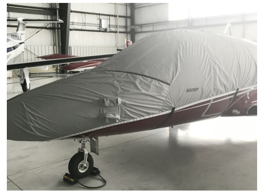
Eclipse EA550 Travel Canopy/Nose Cover