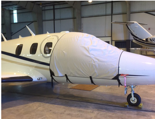
Eclipse Cockpit Door Cover, with Pitot Tube Covers

This cover type is made from Silver Acrylic Sunbrella canvas and is 100% lined with a soft and smooth microfiber. Bruce's Custom Covers developed this material combination especially for aircraft protection. The outer material is medium weight and treated for water resistance, UV resistance and anti-static buildup. The inner lining is a very soft and smooth microfiber to prevent scratching. The material is very reflective, and tests show that the cabin interior temperature can be reduced to near-ambient temperature on the hottest of days. It is water, ice and snow repellent, yet breathable to allow moisture to escape from between the cover and the aircraft surface.