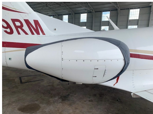
Engine Cover Wraps

The Eclipse EA500, TE500, 550 Bikini Style Engine Covers are a single-piece design using a soft and smooth stretchy fabric. The cover stretches tightly over both the intake and exhaust, installing quickly and easily. These covers are designed to be used as hangar dust covers and have a useful life of approximately one year.