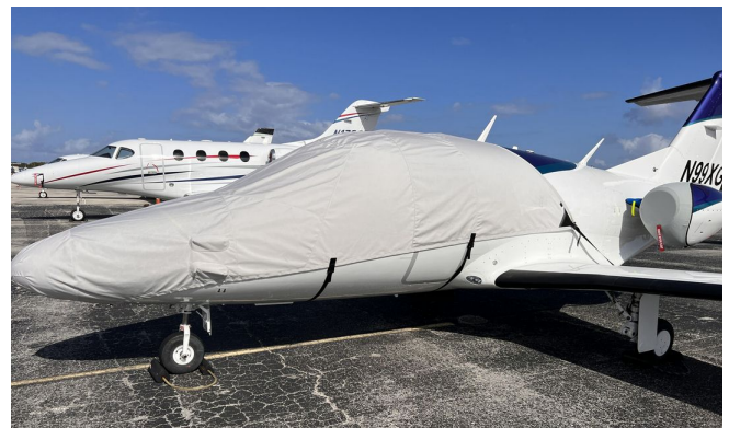
Eclipse EA500 Canopy/Nose Cover