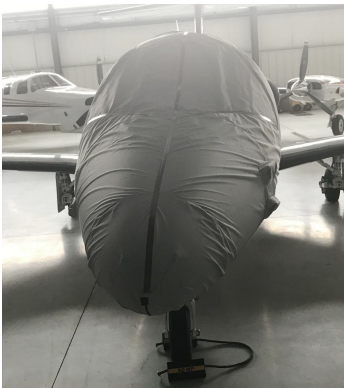
Eclipse EA550 Travel Canopy/Nose Cover

This cover type is made from Silver Acrylic Sunbrella canvas and is 100% lined with a soft and smooth microfiber. Bruce's Custom Covers developed this material combination especially for aircraft protection. The outer material is medium weight and treated for water resistance, UV resistance and anti-static buildup. The inner lining is a very soft and smooth microfiber to prevent scratching. The material is very reflective, and tests show that the cabin interior temperature can be reduced to near-ambient temperature on the hottest of days. It is water, ice and snow repellent, yet breathable to allow moisture to escape from between the cover and the aircraft surface.