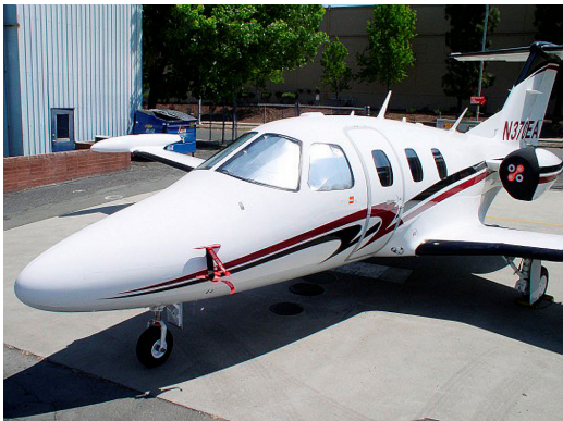
Eclipse Pitot Cover & Bikini Type Engine Covers