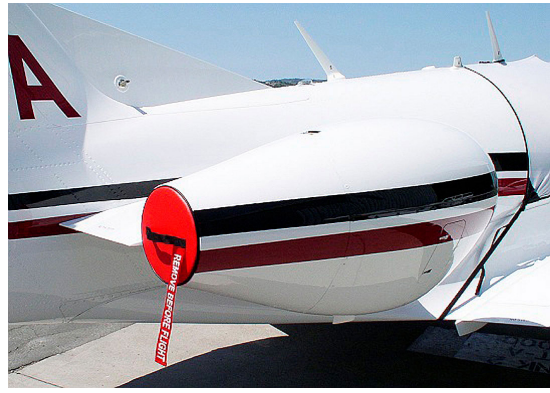
Eclipse Engine Exhaust Plugs set