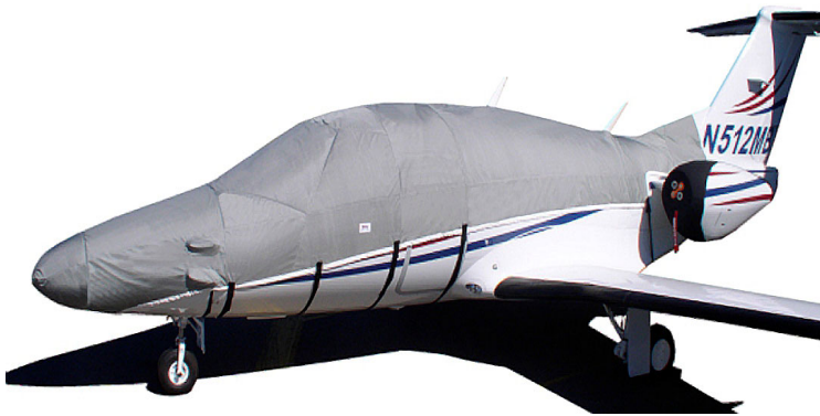
Fuselage Cover, hail protection on all upper surfaces

This cover type is made from Silver Acrylic Sunbrella canvas and is 100% lined with a soft and smooth microfiber. Bruce's Custom Covers developed this material combination especially for aircraft protection. The outer material is medium weight and treated for water resistance, UV resistance and anti-static buildup. The inner lining is a very soft and smooth microfiber to prevent scratching. The material is very reflective, and tests show that the cabin interior temperature can be reduced to near-ambient temperature on the hottest of days. It is water, ice and snow repellent, yet breathable to allow moisture to escape from between the cover and the aircraft surface.