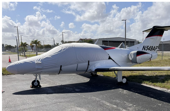
Eclipse EA500 Canopy/Nose Cover