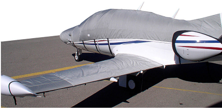
Fuselage Cover & Wing Covers with hail protection on all upper surfaces

WINTER USE MATERIAL - Made with Solution-Dyed Polyester fabric, this option is intended for seasonal use to aid in deicing, rain mitigation, or for occasional travel. The material is lighter and more compact, but more susceptible to UV damage and may have a shorter useful life if used continuously outside than the all-year use material.