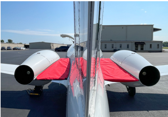
Eclipse EA500, TE500, 550 Pylon Covers