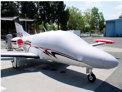
Eclipse Light Weight Travel Cover & Engine Plugs