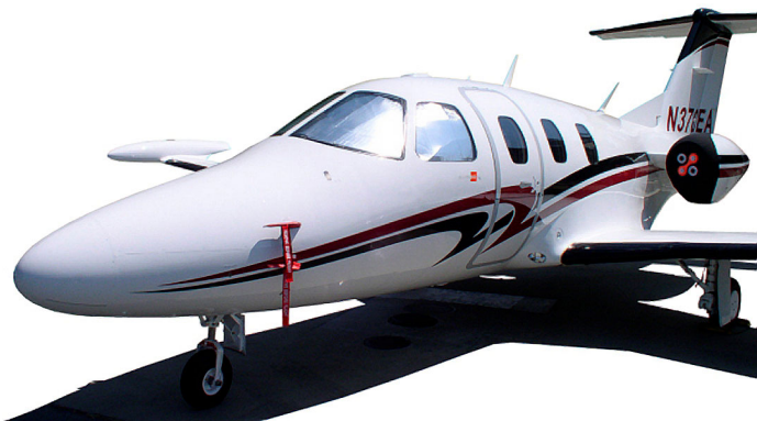
Cockpit HeatShields, Pitot Covers & "Bikini" style Engine Covers

necessary. Engine plugs have 'remove before flight' streamers sewn onto the face of the plugs. Most plugs are imprinted with the aircraft registration number in black for an extra charge. Storage bag NOT included. Engine plugs may be inserted after flight when the engine is still warm. Engine Inlet Plugs are commonly referred to as Cowl Plugs, Intake Plugs, Cowl Blocks, Engine Blocks, and Engine Bunges.