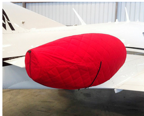
Eclipse Insulated Engine Cover