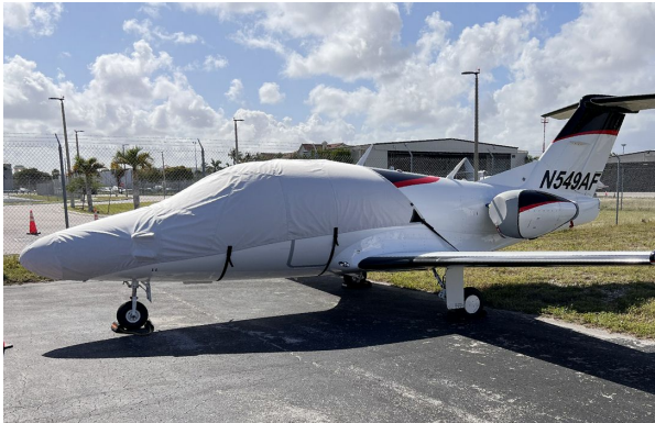
Eclipse EA500 Canopy/Nose Cover