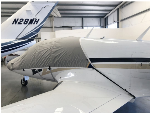
Eclipse EA500 Travel Weight Canopy/Nose Cover

This cover type is made from Silver Acrylic Sunbrella canvas and is 100% lined with a soft and smooth microfiber. Bruce's Custom Covers developed this material combination especially for aircraft protection. The outer material is medium weight and treated for water resistance, UV resistance and anti-static buildup. The inner lining is a very soft and smooth microfiber to prevent scratching. The material is very reflective, and tests show that the cabin interior temperature can be reduced to near-ambient temperature on the hottest of days. It is water, ice and snow repellent, yet breathable to allow moisture to escape from between the cover and the aircraft surface.