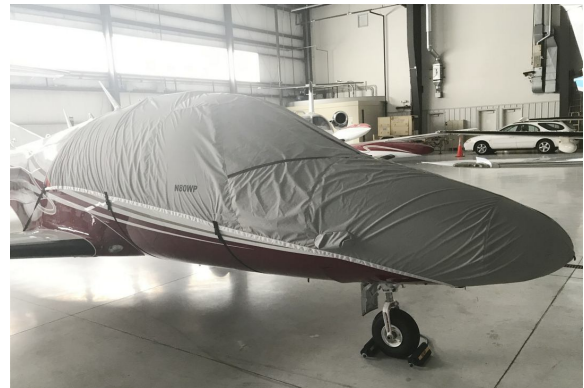
Eclipse EA550 Travel Canopy/Nose Cover