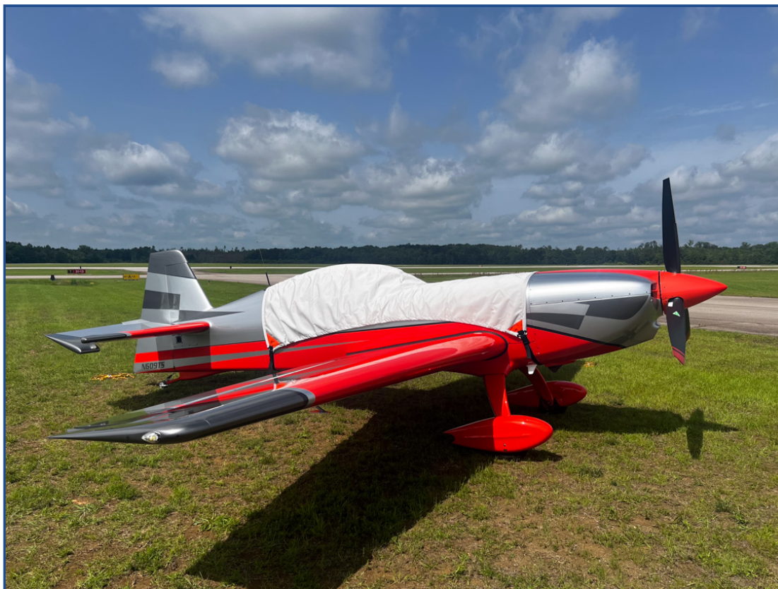
Extra NG Canopy Cover, Single Place Canopy