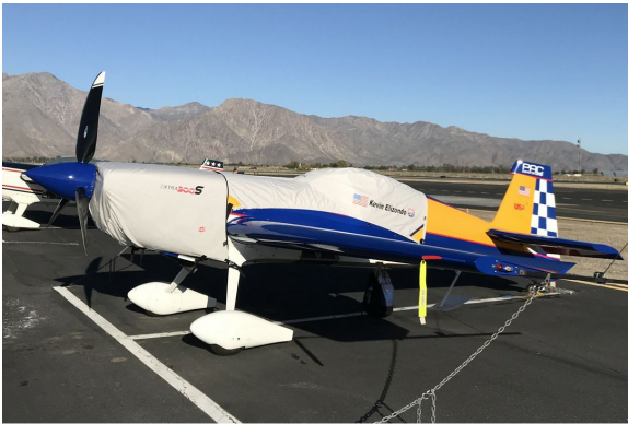
Extra 300S Canopy & Engine Covers