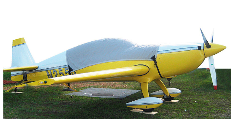
Xtremeair Canopy Cover

This cover type is made from Silver Acrylic Sunbrella canvas and is 100% lined with a soft and smooth microfiber. Bruce's Custom Covers developed this material combination especially for aircraft protection. The outer material is medium weight and treated for water resistance, UV resistance and anti-static buildup. The inner lining is a very soft and smooth microfiber to prevent scratching. The material is very reflective, and tests show that the cabin interior temperature can be reduced to near-ambient temperature on the hottest of days. It is water, ice and snow repellent, yet breathable to allow moisture to escape from between the cover and the aircraft surface.