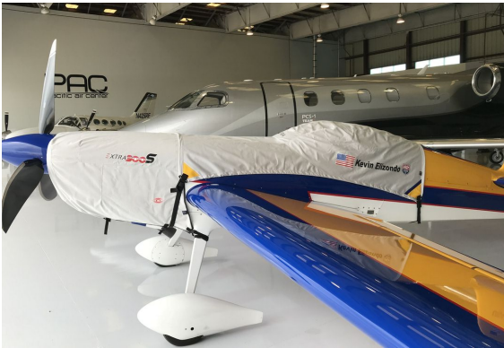
Extra 300S Canopy & Engine Covers

This cover type is made from Silver Acrylic Sunbrella canvas and is 100% lined with a soft and smooth microfiber. Bruce's Custom Covers developed this material combination especially for aircraft protection. The outer material is medium weight and treated for water resistance, UV resistance and anti-static buildup. The inner lining is a very soft and smooth microfiber to prevent scratching. The material is very reflective, and tests show that the cabin interior temperature can be reduced to near-ambient temperature on the hottest of days. It is water, ice and snow repellent, yet breathable to allow moisture to escape from between the cover and the aircraft surface.