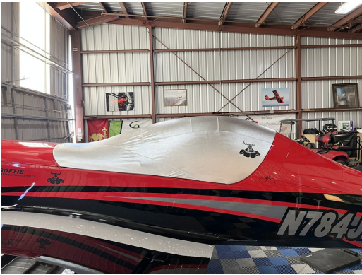
Gamebird GB-1 Solar Cap (single place), CUSTOM COVERS & IMPRINTING AVAILABLE!

Travel Covers are made with Silver Solution-Dyed Polyester fabric and only lined over the windshield to save weight. The material is lightweight and more compact for easy stowage in the aircraft. The polyester material is water resistant, but only intended for occasional use outside. We also have an ultra lightweight material available for fitted hangar dust covers. For daily outdoor use, the non-travel Sunbrella Cover is the best choice.