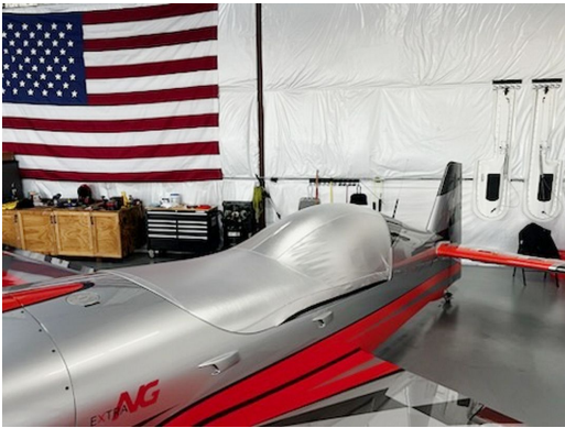
Extra NG Models Canopy Cover