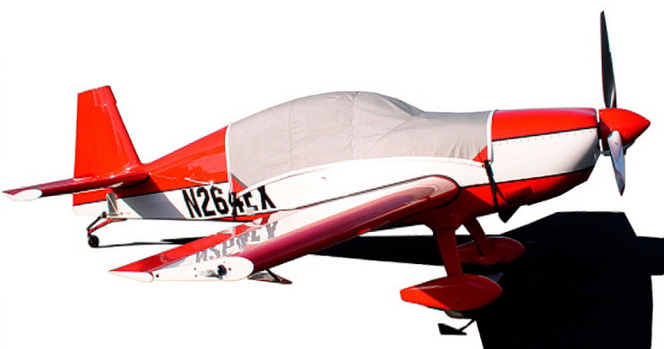
Canopy Cover for the Extra 300