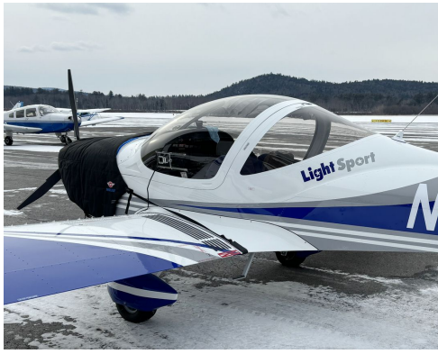
Evektor Harmony Insulated Engine Cover