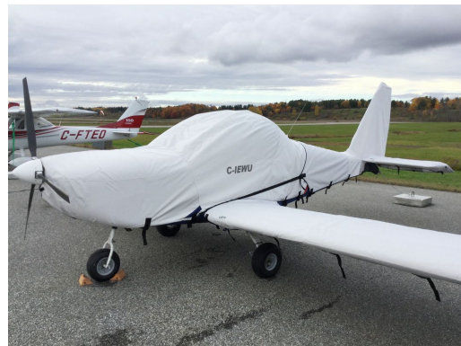
Evektor Sportstar Full Cover Set