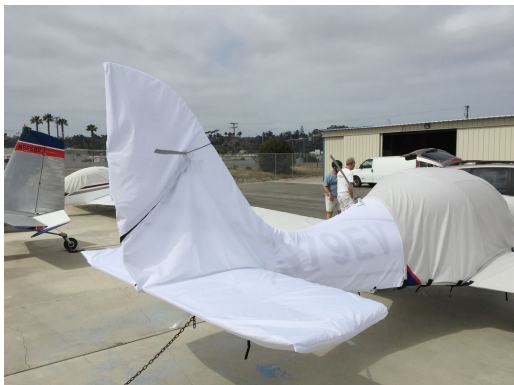
Evektor SportStar, Eurostar, Max Empennage Cover, test fit cover.

shorter useful life if used continuously outside than the all-year use material.