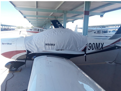
Evektor Sportstar Max Canopy Cover

This cover type is made from Silver Acrylic Sunbrella canvas and is 100% lined with a soft and smooth microfiber. Bruce's Custom Covers developed this material combination especially for aircraft protection. The outer material is medium weight and treated for water resistance, UV resistance and anti-static buildup. The inner lining is a very soft and smooth microfiber to prevent scratching. The material is very reflective, and tests show that the cabin interior temperature can be reduced to near-ambient temperature on the hottest of days. It is water, ice and snow repellent, yet breathable to allow moisture to escape from between the cover and the aircraft surface.