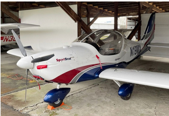
Evektor SportStar Engine & Vent Plugs

Engine Inlet Plugs are custom fit for your Evektor-Aerotechnik SportStar, Eurostar, Max, Harmony intakes, made with heavy-duty vinyl material, and stuffed with a single block of sculpted urethane foam. Each plug has a zipper that allows the foam to be removed and dried if necessary. Engine plugs have warning flags that are visible from the cockpit or 'remove before flight' streamers sewn onto the face of the plugs. Most plugs are imprinted with the aircraft registration number in black for an extra charge. Storage bag NOT included. Engine plugs may be inserted after flight when the engine is still warm. Engine Inlet Plugs are commonly referred to as Cowl Plugs, Intake Plugs, Cowl Blocks, Engine Blocks, and Engine Bungs.