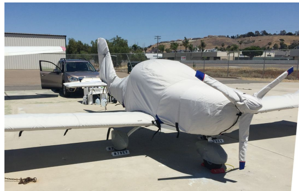
2017 Evektor Sportstar Max Extended Canopy/Engine Cover