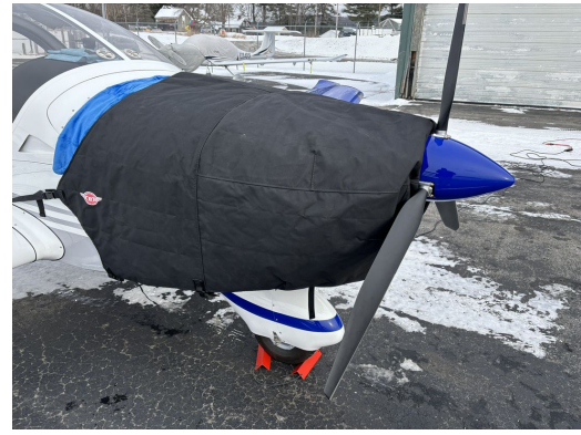
Evektor Harmony Insulated Engine Cover