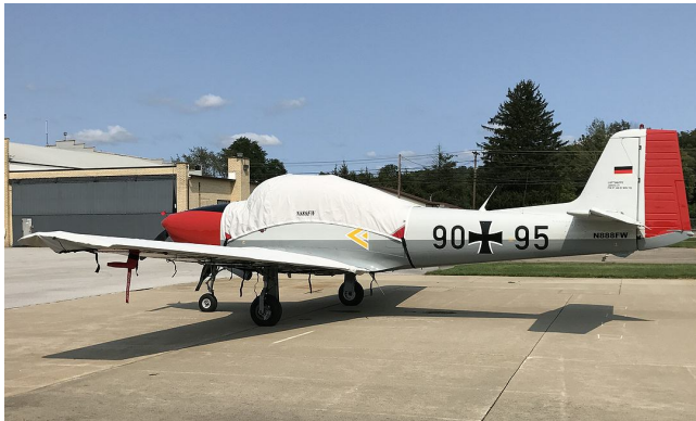
Focke Wulf F149 Canopy Cover, Wing Covers

of the Canopy Cover and Engine Cover. This cover will enclose the engine cowl and will extend aft to cover all of the windows. This cover type is made from Silver Acrylic Sunbrella canvas and is 100% lined with a soft and smooth microfiber. Bruce's Custom Covers developed this material combination especially for aircraft protection. The outer material is medium weight and treated for water resistance, UV resistance and anti-static buildup. The inner lining is a very soft and smooth microfiber to prevent scratching. The material is very reflective, and tests show that the cabin interior temperature can be reduced to near-ambient temperature on the hottest of days. It is water, ice and snow repellent, yet breathable to allow moisture to escape from between the cover and the aircraft surface.