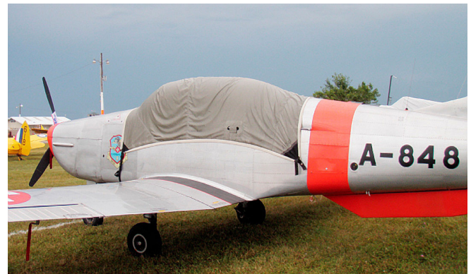
Piaggio P-149D Trainer Canopy Cover