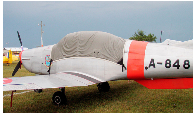
Piaggio P-149D Trainer Canopy Cover