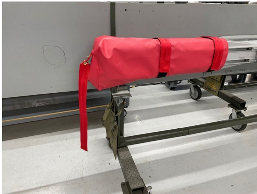
McDonnell Douglas F-15 Launcher Rail Cover

ALL-YEAR USE MATERIAL - Made with Silver Acrylic Sunbrella canvas, the all-year use material is the best option for sun protection and cover longevity. This heavier more durable material is intended for all weather conditions, such as rain and snow or lots of sun.