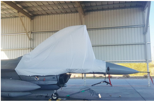
F-16 CANOPY COVER, OPEN POSITION (C-Model, single seat models) McDonnell Douglas F16-D Canopy Cover, open cockpit type (test fit cover)