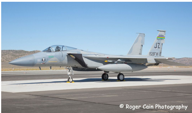
McDonnell-Douglas F-15 Intake Covers

The McDonnell Douglas F-15 Eagle Intake Covers are designed to install easily yet be completely storable. A spring steel hoop is sewn into the hem of each cover, allowing them to be installed without climbing onto the wing or using a stepladder. To store the covers the spring steel hoop folds like a band-saw blade into three nesting rings. Each cover folds into a compact circular bundle which is stored in the included duffle bag, yet they unfold quickly for use. The Tri-Fold Ring cover is made of medium weight nylon which is available in a variety of colors to match the paint trim. Each cover set comes complete with installation and folding instructions. The aircraft's registration number can be silkscreened onto the cover for an extra charge.