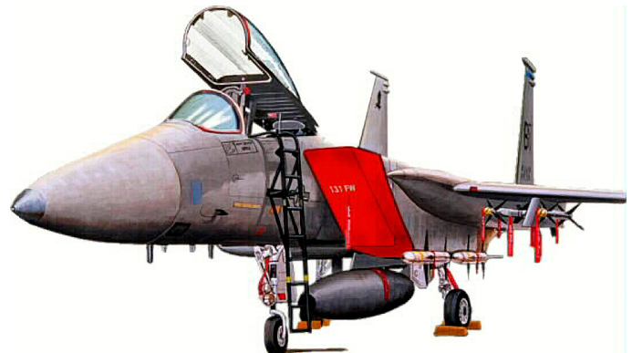
F15 Cockpit HeatShields & Inlet Cover