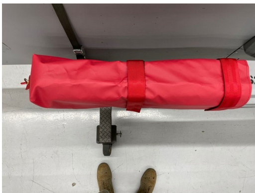
McDonnell Douglas F-15 Launcher Rail Cover

ALL-YEAR USE MATERIAL - Made with Silver Acrylic Sunbrella canvas, the all-year use material is the best option for sun protection and cover longevity. This heavier more durable material is intended for all weather conditions, such as rain and snow or lots of sun.