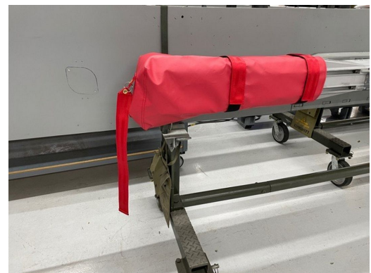
McDonnell Douglas F-15 Launcher Rail Cover