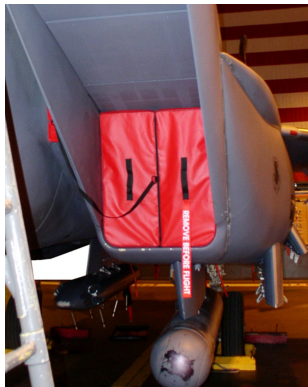
F15 Intake Plugs

The Engine Inlet Plugs are custom fit for your McDonnell Douglas F-15 Eagle intakes, made with heavy-duty vinyl material, and stuffed with a single block of sculpted urethane foam. Each plug has a zipper that allows the foam to be removed and dried if necessary. Engine plugs have 'remove before flight' streamers sewn onto the face of the plugs. Most plugs are imprinted with the aircraft registration number in black for an extra charge. Storage bag NOT included. Engine plugs may be inserted after flight when the engine is still warm. Engine Inlet Plugs are commonly referred to as Cowl Plugs, Intake Plugs, Cowl Blocks, Engine Blocks, and Engine Bungs.