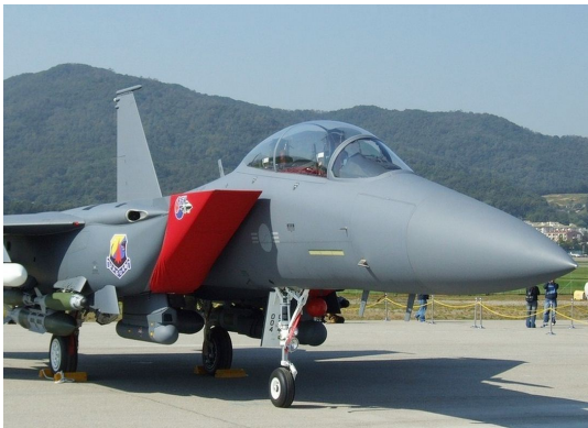
F15 Intake Cover McDonnell Douglas F-15 Eagle Engine Inlet Covers