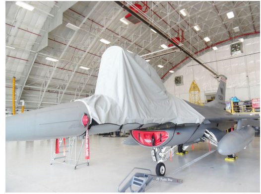
F-16 CANOPY COVER, OPEN POSITION (C-Model, single seat models)