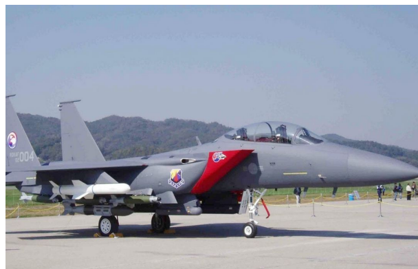
McDonnell Douglas F-15 Eagle Engine Inlet Covers