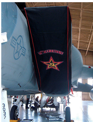
F15 Intake Cover

The McDonnell Douglas F-15 Eagle Intake Covers are designed to install easily yet be completely storable. A spring steel hoop is sewn into the hem of each cover, allowing them to be installed without climbing onto the wing or using a stepladder. To store the covers the spring steel hoop folds like a band-saw blade into three nesting rings. Each cover folds into a compact circular bundle which is stored in the included duffle bag, yet they unfold quickly for use. The Tri-Fold Ring cover is made of medium weight nylon which is available in a variety of colors to match the paint trim. Each cover set comes complete with installation and folding instructions. The aircraft's registration number can be silkscreened onto the cover for an extra charge.