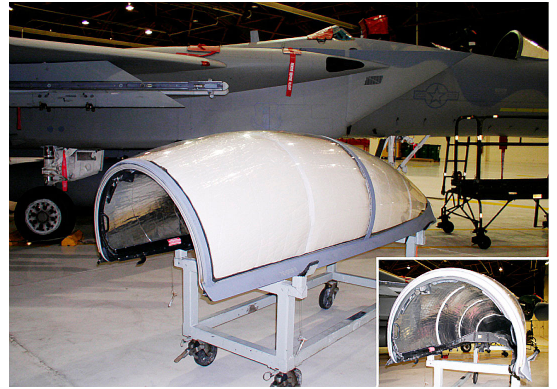
F-15 Cockpit HeatShield