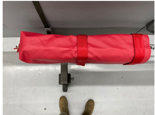
McDonnell Douglas F-15 Launcher Rail Cover