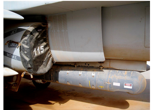
F-18 Intake Covers