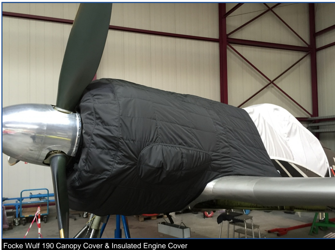
Focke Wulf 190 Canopy Cover &amp; Insulated Engine Cover