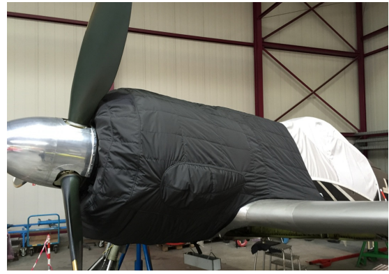
Focke Wulf 190 Canopy Cover & Insulated Engine Cover