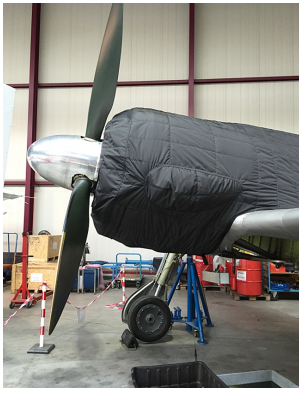
Focke Wulf 190 Insulated Engine Cover