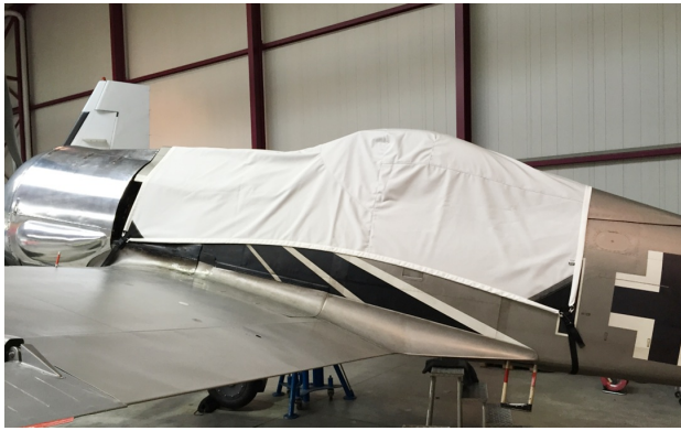
Focke Wulf 190 Canopy Cover