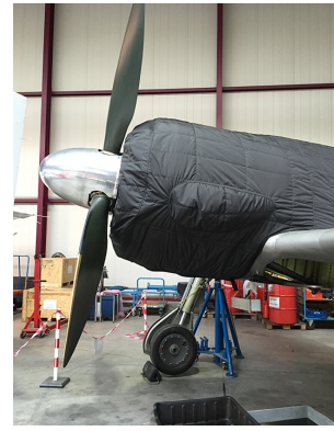
Focke Wulf 190 Insulated Engine Cover