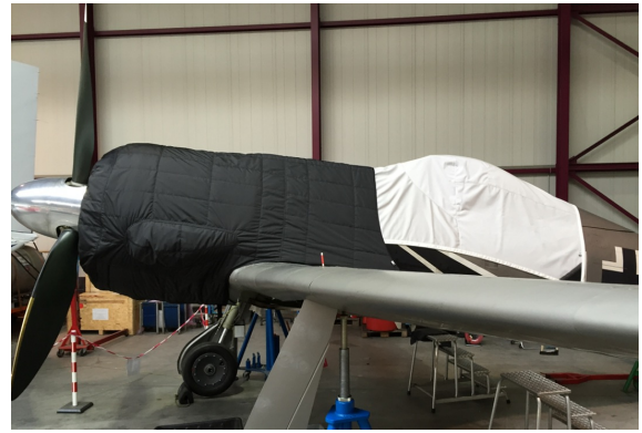
Focke Wulf 190 Canopy Cover & Insulated Engine Cover