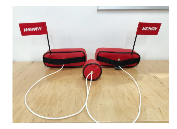
F1 Rocket Engine Plugs too small to imprint on plugs