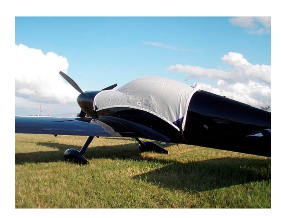
Harmon Rocket Canopy Cover