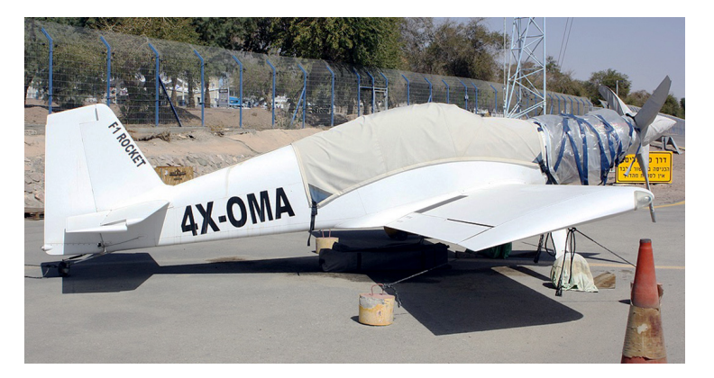
You should always cover your plane.