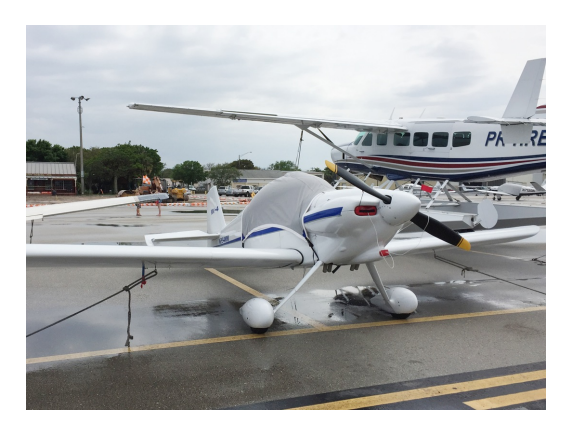
Van's RV-4/Harmon Rocket Travel Cover

Travel Covers are made with Silver Solution-Dyed Polyester fabric and only lined over the windshield to save weight. The material is lightweight and more compact for easy stowage in the aircraft. The polyester material is water resistant, but only intended for occasional use outside. We also have an ultra lightweight material available for fitted hangar dust covers. For daily outdoor use, the non-travel Sunbrella Cover is the best choice.