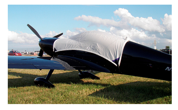
F1 Rocket Canopy Cover

This cover type is made from Silver Acrylic Sunbrella canvas and is 100% lined with a soft and smooth microfiber. Bruce's Custom Covers developed this material combination especially for aircraft protection. The outer material is medium weight and treated for water resistance, UV resistance and anti-static buildup. The inner lining is a very soft and smooth microfiber to prevent scratching. The material is very reflective, and tests show that the cabin interior temperature can be reduced to near-ambient temperature on the hottest of days. It is water, ice and snow repellent, yet breathable to allow moisture to escape from between the cover and the aircraft surface.