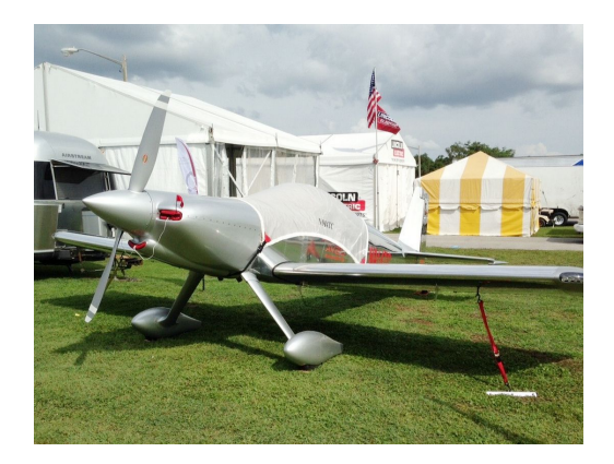
F1 Rocket Canopy Cover, Engine Plugs

Engine Inlet Plugs are custom fit for your Team Rocket F1 Rocket, F4 Raider intakes, made with heavy-duty vinyl material, and stuffed with a single block of sculpted urethane foam. Each plug has a zipper that allows the foam to be removed and dried if necessary. Engine plugs have warning flags that are visible from the cockpit or 'remove before flight' streamers sewn onto the face of the plugs. Most plugs are imprinted with the aircraft registration number in black for an extra charge. Storage bag NOT included. Engine plugs may be inserted after flight when the engine is still warm. Engine Inlet Plugs are commonly referred to as Cowl Plugs, Intake Plugs, Cowl Blocks, Engine Blocks, and Engine Bungs.