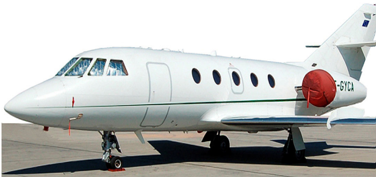
Falcon Engine Cover & Cockpit HeatShields