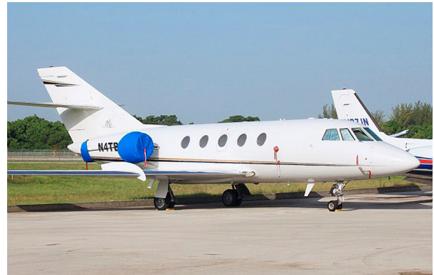
Falcon Engine Cover & Cockpit HeatShields