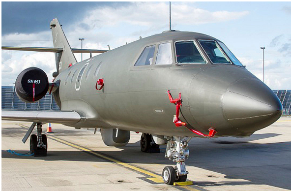
Falcon Engine Covers (not our probe covers)

The Falcon Jet 20 (HU-25) Intake/Exhaust Plugs are custom fit for the intake and exhaust openings, made with heavy-duty vinyl material, and stuffed with a single block of sculpted urethane foam. Each plug has a zipper that allows the foam to be removed and dried if necessary. Engine plugs have 'remove before flight' streamers sewn onto the face of the plugs. Most plugs are imprinted with the aircraft registration number in black. Engine plugs may be inserted after flight when the engine is still warm. Engine Inlet Plugs are commonly referred to as Cowl Plugs, Intake Plugs, Cowl Blocks, Engine Blocks, and Engine Bungs.