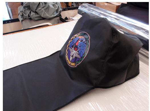
F22 Raptor Ejection Seat Maintenance Cover