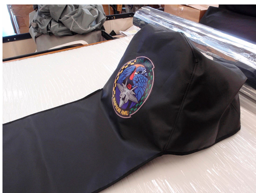
F22 Raptor Ejection Seat Maintenance Cover

The Engine Inlet Plugs are custom fit for your Lockheed Martin/Boeing F-22 Raptor intakes, made with heavy-duty vinyl material, and stuffed with a single block of sculpted urethane foam. Each plug has a zipper that allows the foam to be removed and dried if necessary. Engine plugs have 'remove before flight' streamers sewn onto the face of the plugs. Most plugs are imprinted with the aircraft registration number in black for an extra charge. Storage bag NOT included. Engine plugs may be inserted after flight when the engine is still warm. Engine Inlet Plugs are commonly referred to as Cowl Plugs, Intake Plugs, Cowl Blocks, Engine Blocks, and Engine Bungs.