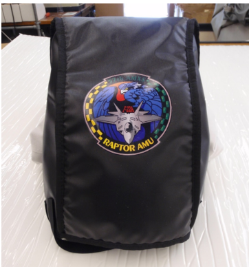
F-22 Raptor HUD Cover, padded