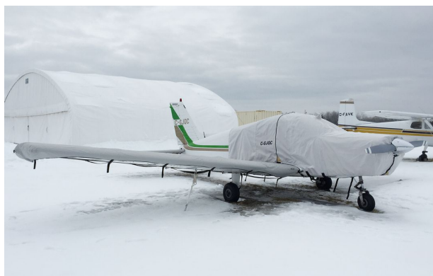
Piper PA-28 Extended Canopy/Engine, Wing & Horizontal Stabilizer Covers