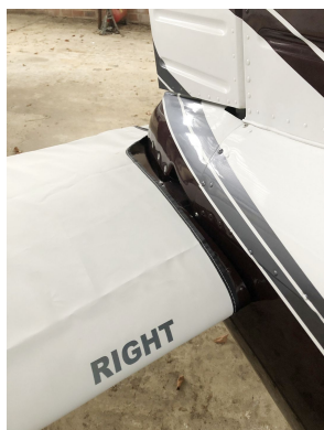
Piper PA-28 Horizontal Stabilizer Cover

mitigation, or for occasional travel. The material is lighter and more compact, but more susceptible to UV damage and may have a shorter useful life if used continuously outside than the all-year use material.