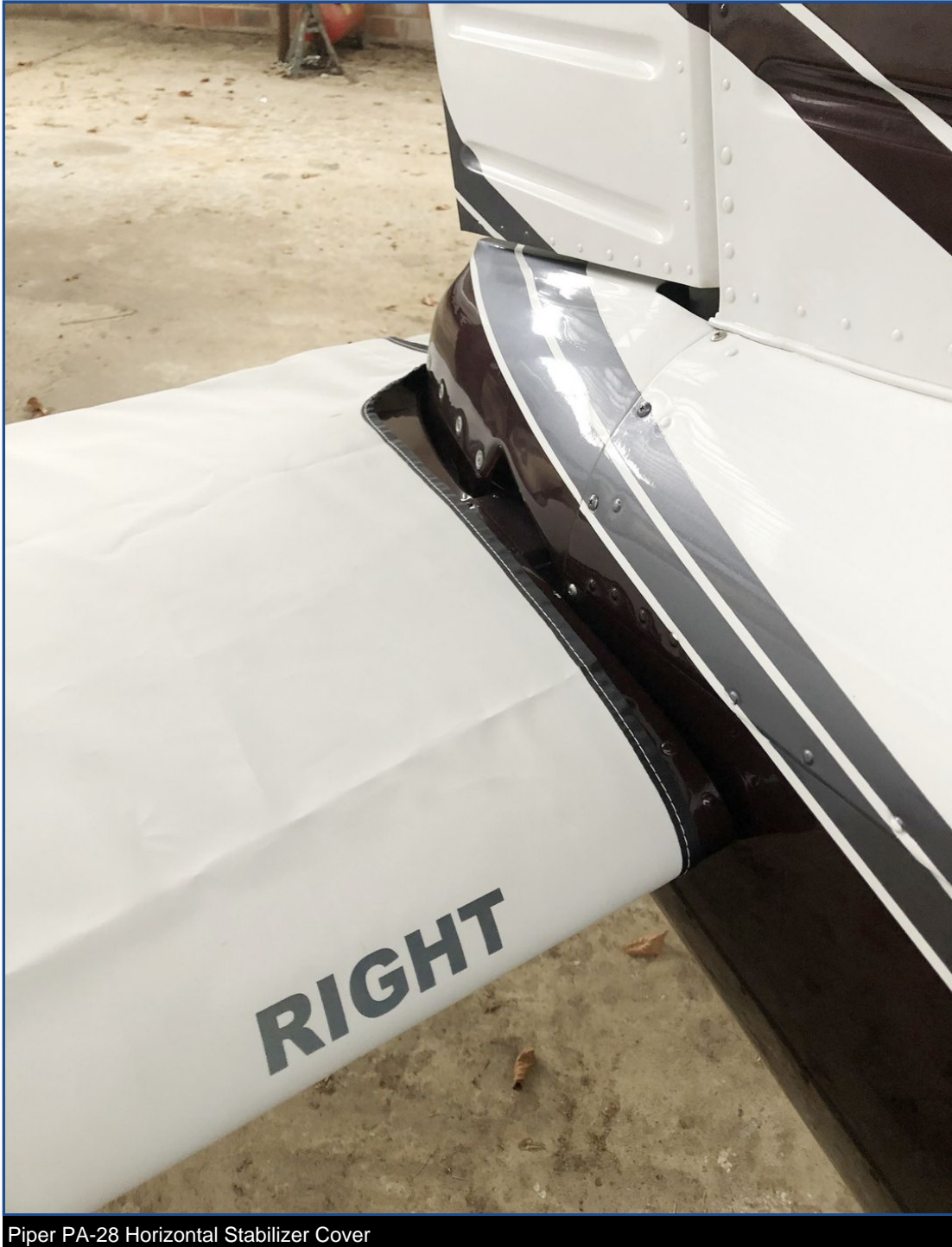
Piper PA-28 Horizontal Stabilizer Cover