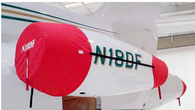
Falcon 900 Engine Cover Set

The Falcon Jet 50EX Bikini Style Engine Covers are a single-piece design using a soft and smooth stretchy and fabric. The cover stretches tightly over both the intake and exhaust, installing quickly and easily. These covers are designed to be used as hangar dust covers and have a useful life of approximately one year.