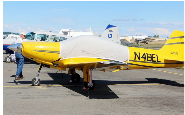
Falco Canopy Cover