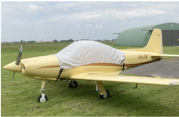
Sequoia Falco Canopy Cover

This cover type is made from Silver Acrylic Sunbrella canvas and is 100% lined with a soft and smooth microfiber. Bruce's Custom Covers developed this material combination especially for aircraft protection. The outer material is medium weight and treated for water resistance, UV resistance and anti-static buildup. The inner lining is a very soft and smooth microfiber to prevent scratching. The material is very reflective, and tests show that the cabin interior temperature can be reduced to near-ambient temperature on the hottest of days. It is water, ice and snow repellent, yet breathable to allow moisture to escape from between the cover and the aircraft surface.