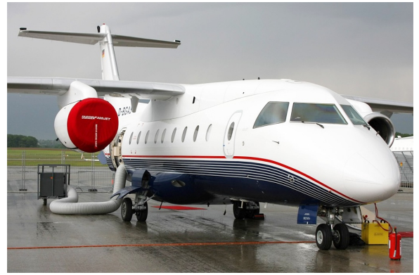
Fairchild/Dornier 328 Engine Covers