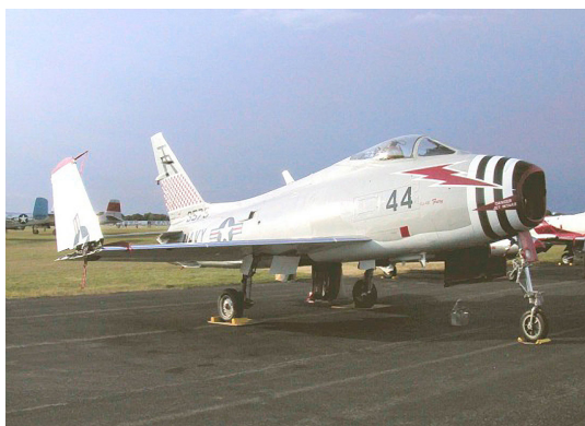
Covers for the FJ-4 Fury