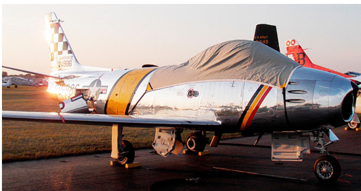
F86 Sabre Canopy Cover