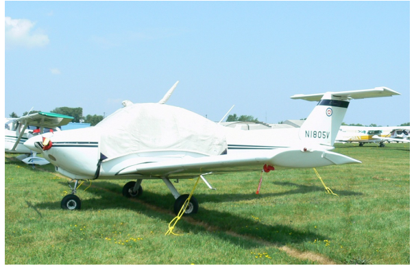
Beech Skipper Canopy Cover, Engine Plugs