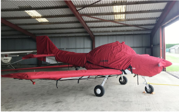
FLS Club Sprint Extended Canopy Cover

Covers developed this material combination especially for aircraft protection. The outer material is medium weight and treated for water resistance, UV resistance and anti-static buildup. The inner lining is a very soft and smooth microfiber to prevent scratching. The material is very reflective, and tests show that the cabin interior temperature can be reduced to near-ambient temperature on the hottest of days. It is water, ice and snow repellent, yet breathable to allow moisture to escape from between the cover and the aircraft surface.