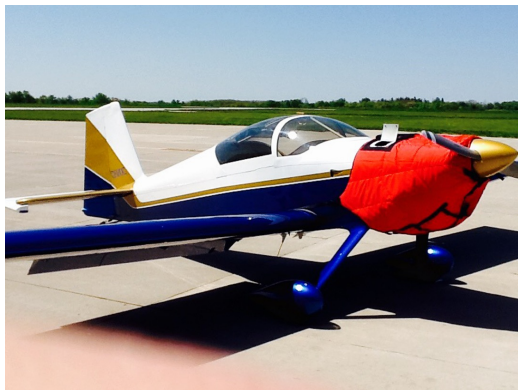
Van's RV-7 Insulated Engine Cover