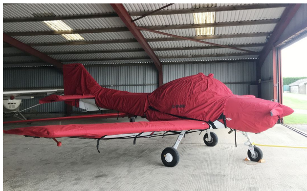
FLS Club Sprint Extended Canopy Cover

Covers developed this material combination especially for aircraft protection. The outer material is medium weight and treated for water resistance, UV resistance and anti-static buildup. The inner lining is a very soft and smooth microfiber to prevent scratching. The material is very reflective, and tests show that the cabin interior temperature can be reduced to near-ambient temperature on the hottest of days. It is water, ice and snow repellent, yet breathable to allow moisture to escape from between the cover and the aircraft surface.