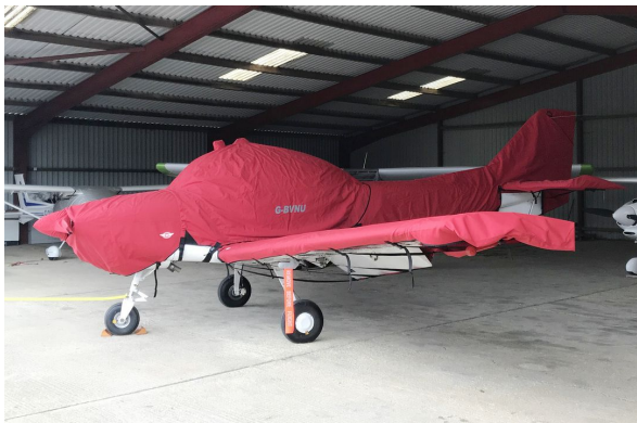
FLS Club Sprint Engine Cover

Engine Covers will cinch around or behind the spinner, cover the entire engine cowl area including the engine air cooling and induction air inlets, and fastens together with Velcro beneath the spinner down the front of the cowling. The Engine Cover is attached with a belly strap aft of the firewall, and can Velcro to the Canopy Cover. Engine Covers are normally made from Solution-Dyed Polyester or Acrylic Sunbrella . An Insulated version of the engine cover can be made with a thicker, quilted, and water-repellent material. The Insulated Engine Cover works well in cold climates to help with engine preheating.