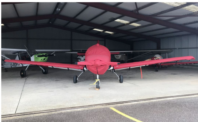
FLS Club Sprint Empennage Cover (Tailboom, Vertical & Horiz Stabilizers) All Year Use