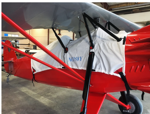
Davis D-1K Canopy Cover