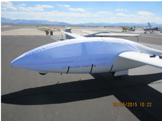
DG-505 Canopy/Nose Cover (test fit cover)