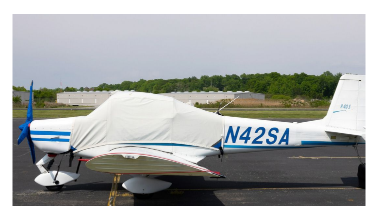
S C Aerostar Festival Canopy Cover