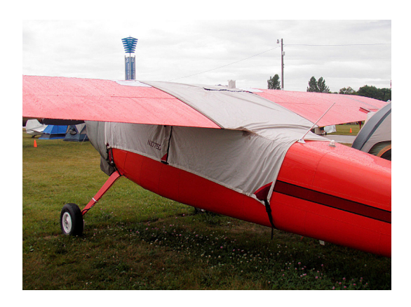
Over-Top Canopy Cover & Engine Cover

The material is very reflective, and tests show that the cabin interior temperature can be reduced to near-ambient temperature on the hottest of days. It is water, ice and snow repellent, yet breathable to allow moisture to escape from between the cover and the aircraft surface.