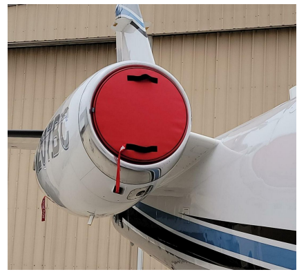
Gulfstream G100 Intake Plugs