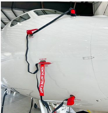
Gulfstream GVII Pitot Probes/TAT/Ice Detector Set, Heat Resistant Type

Gulfstream Aerospace Gulfstream G100 Heat Resistant Pitot Tube Covers are made of Naugahyde vinyl, and lined with a non-burning material. They are designed to cover the entire pitot assembly, slipping over the tube and tightening around the base with a Velcro strap detail. A "Remove Before Flight" streamer is attached to the cover. Heat Resistant Pitot Covers are an upgrade to our standard design, and help prevent the pitot cover from melting onto the tube if the pitot heat is accidentally turned on while installed. If you want the set tethered together, please let us know.