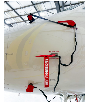
Gulfstream GVII Pitot Probes/TAT/Ice Detector Set, Heat Resistant Type