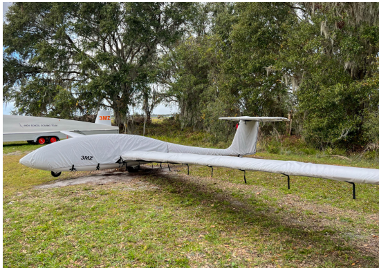
Burkhart Grob G 103 TWIN II Complete Cover Set