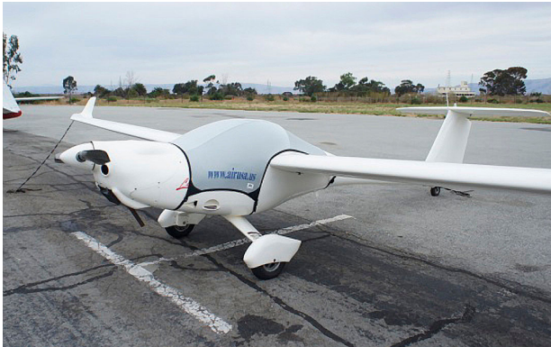
Lambda Canopy Cover