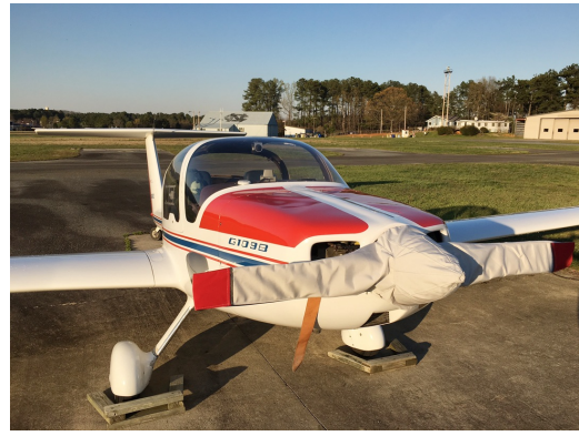
Grob 109 Prop Cover