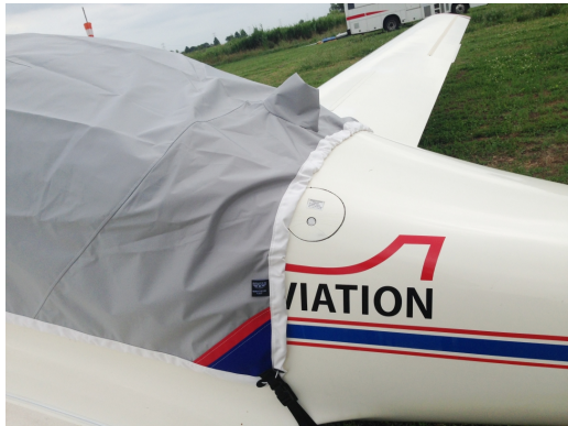
Grob 109 Travel Cover, Light Weight Travel Canopy Cover