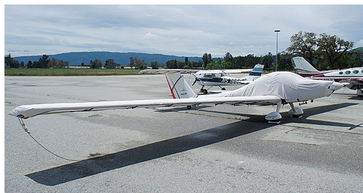
Grob 109 Canopy/Engine w/ extension to tail, Wing, Stabilizer & Prop/Spinner Covers