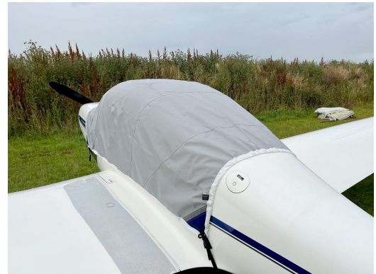
Grob 109 Travel Cover, Light Weight Canopy Cover