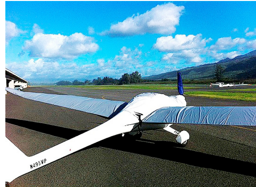
Lambda Canopy/Engine Cover and Wing Covers