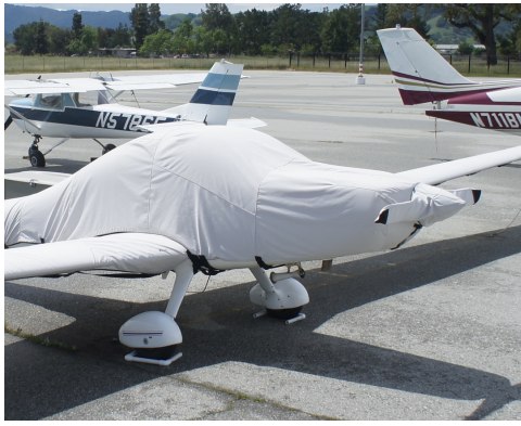
Grob 109 Prop Cover