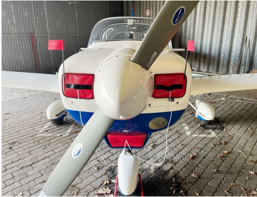
Grob 115 Engine Inlet Plugs, Incl. Carb. Inlet Plug

Engine Inlet Plugs are custom fit for your Grob 115 intakes, made with heavy-duty vinyl material, and stuffed with a single block of sculpted urethane foam. Each plug has a zipper that allows the foam to be removed and dried if necessary. Engine plugs have warning flags that are visible from the cockpit or 'remove before flight' streamers sewn onto the face of the plugs. Most plugs are imprinted with the aircraft registration number in black for an extra charge. Storage bag NOT included. Engine plugs may be inserted after flight when the engine is still warm. Engine Inlet Plugs are commonly referred to as Cowl Plugs, Intake Plugs, Cowl Blocks, Engine Blocks, and Engine Bungs.