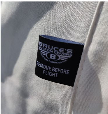
Grob 115 Canopy Cover, Label Detail