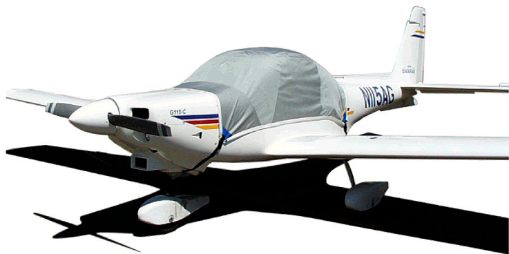
Grob 115 Bavarian Canopy Cover

The Grob 115 Canopy/Engine Cover is a one-piece cover (100% lined with microfiber) that is a combination of the Canopy Cover and Engine Cover. This cover will enclose the engine cowl and will extend aft to cover all of the windows. This cover type is made from Silver Acrylic Sunbrella canvas and is 100% lined with a soft and smooth microfiber. Bruce's Custom Covers developed this material combination especially for aircraft protection. The outer material is medium weight and treated for water resistance, UV resistance and anti-static buildup. The inner lining is a very soft and smooth microfiber to prevent scratching. The material is very reflective, and tests show that the cabin interior temperature can be reduced to near-ambient temperature on the hottest of days. It is water, ice and snow repellent, yet breathable to allow moisture to escape from between the cover and the aircraft surface.